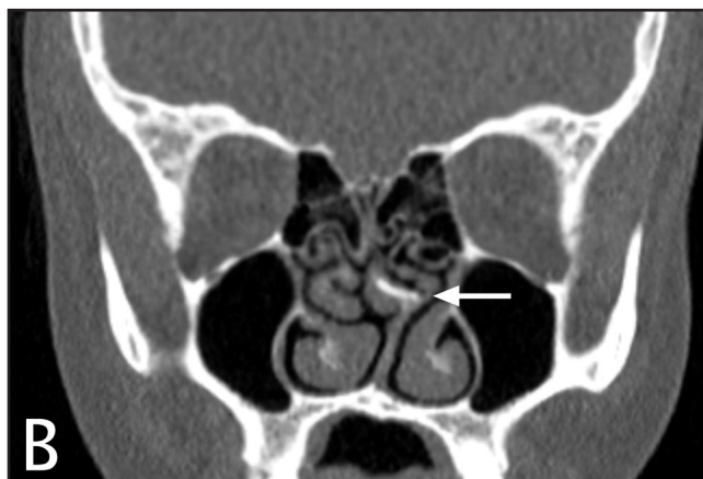
Figure 2. General image quality: Images of 2 different patients whose image quality was interpreted as “good” (A) and moderate (B) by both radiologists. Although the image quality and clarity are different, septum deviation and bone spur formation (arrows) can be easily evaluated in both patients.

The overall image quality of the images in our study was interpreted as 4 (good) or 3 (moderate) for all patients (Figure 2). There were no patients whose image quality was interpreted as 5 (very good), 2 (low), or 1 (not diagnostic). The agreement between radiologists was 92% (Table 1). Nasal septum, bony septa of ethmoid cells, uncinete process of ethmoid bone, maxillary sinus ostium, ethmoid infundibulum and nasolacrimal duct borders were completely visible in all patients. The borders of one or more of the fovea ethmoidalis, cribriform plate and lamina papyracea structures were partially visible in some patients (Figure 3). There was no patient in whom the borders of these structures were not visible at all (Table 2).