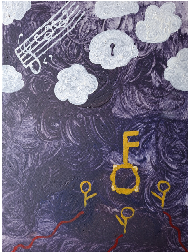
Fig. 1. Cyphart key? © 2024 Nadisha-Marie Aliman. All rights reserved. (Language encoded at the top left: the new meta-language of "cyborgnettish".)

Figure 1 below displays an oil painting (created without the use of algorithmic tools) by the author of this paper, a painter with the heteronym Cyja .