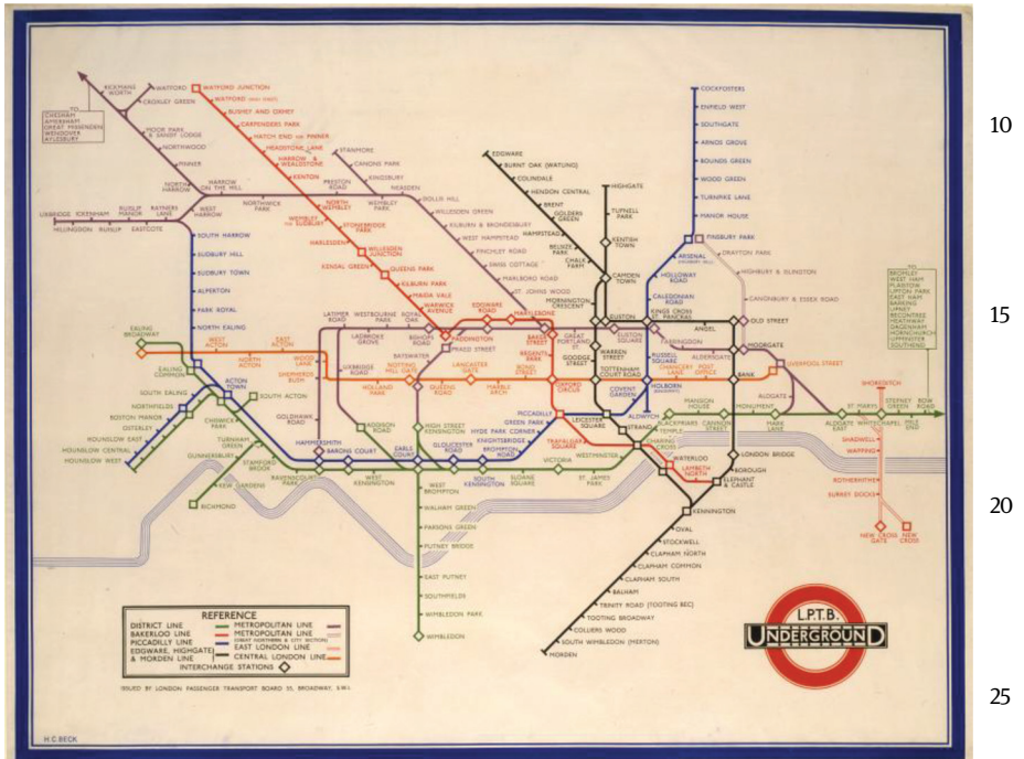
Q5 Figure 2: Beck's original Underground Diagram, from 1933.

Beck's initial sketch was transformed into a properly labeled and color-coded diagram (Figure 2) where he compressed the outlying portions of lines. The central area of the network appears to be viewed through a convex lens so as to enlarge its scale, and route lines are simplified in verticals, horizontals and diagonals (45°) (Garland 1994: 16).