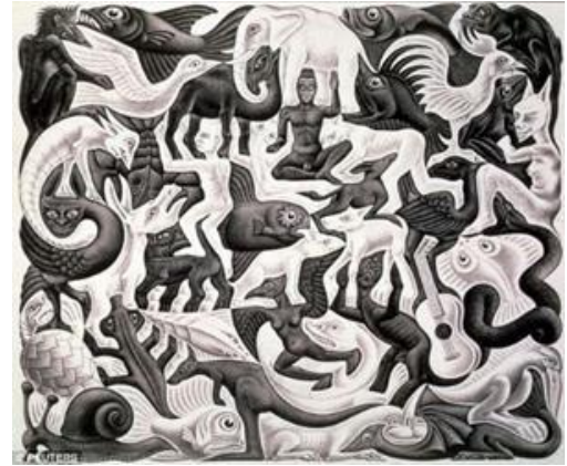
Fig. 2: Mosaic by M. C. Escher

To this question, Kulka offers us a rather easy venue. In following his analysis, we can transform works of art into rules. By fixing the “perceptual gestalt” constant - in our terminology, that is the “what” of the work - we design a rule that takes as arguments all possible variations of the work and admit only variations that keep the gestalt intact. Surely the unaltered work itself is such a variation and can function therefore as an argument. Furthermore, it is easy to see that it must be admitted as falling under itself as a rule, since it clearly does not refute its own gestalt. Next we can compare the admissible versions with respect to the question of whether they improve, damage or stay neutral with respect to the original picture.