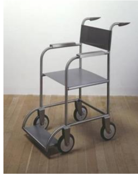
Fig. 4: Mona Hatoum

The point about particulars we should note is that they fall under general concepts whose extensions have as members potentially and as a matter of fact more than one particular. This says of a particular which is not singular rule that it does not present a real case of uniqueness. Science, for example, treats all particulars as falling under non-singular concepts and in this way it obliterates their claim for uniqueness. We could, for sure, resist this over sweeping tendency towards generalization, the subjecting as it were of nature and our immediate surroundings to our concepts and needs, e.g. we may consider an element of our surrounding or of nature unique, as something that does not fall under a concept. But in so doing, in considering for example the scenic view of a landscape unique and inimitable, we actually treat it as a singular rule, that is, we treat it as art. This is where nature presents itself as art, as an ideal or as a model for what art is or should be about. This introduces art's role in society as a constant reminder of nature's uniqueness and hence also as a reminder of the uniqueness of our lives. In that art presents itself as a counterforce against social institutions like the sciences, whose task can be viewed as that of the enslavement of nature to our concepts and pragmatic needs. This is the exact sense in which we could - without falling into a cliché - say that it is art that sets nature and therefore us free.