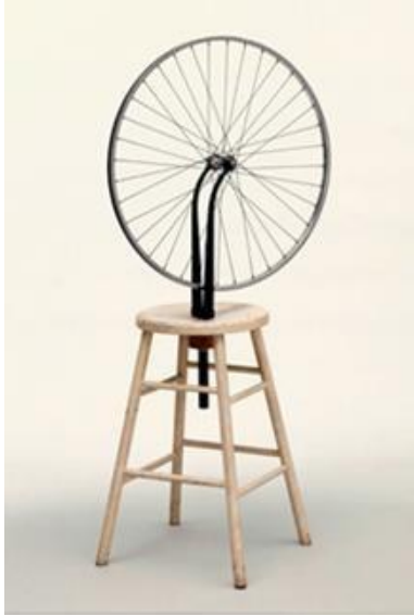
Fig. 3: Marcel Duchamp