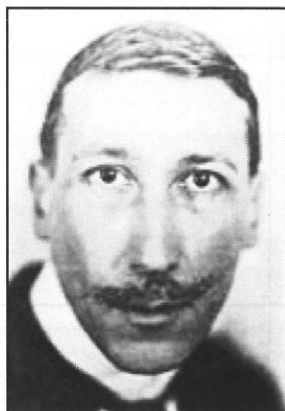
René Guénon (1886-1951)

Guénon examined the dangers of progress, egalitarianism, scientism, psychologism, individualism, pseudo-religion, etc. that mark the utter bankruptcy of the West and its fatal course on this downward spiral.