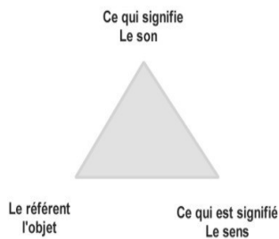
fig 1 the stoicist trinity :