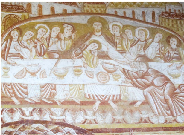
Figure 11. Last Supper , West Choir Wall. Church of Saint Martin de Vicq, France. Early 12th century