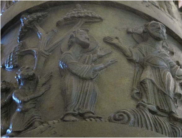
Figure 17. Transfiguration of Jesus, Christ Column, 1020. St. Michael's Church, Hildesheim, Germany

performed by Jesus, this one happens to Jesus, reaffirming, as did the baptism by John, his divinely chosen role as the “Son of God.” Thus, the Transfiguration is a pivotal moment of the New Testament where humankind intersects with God. As Bernward implies artistically, access to the divine is mediated through the sacred sacrament of psychoactive mushrooms.