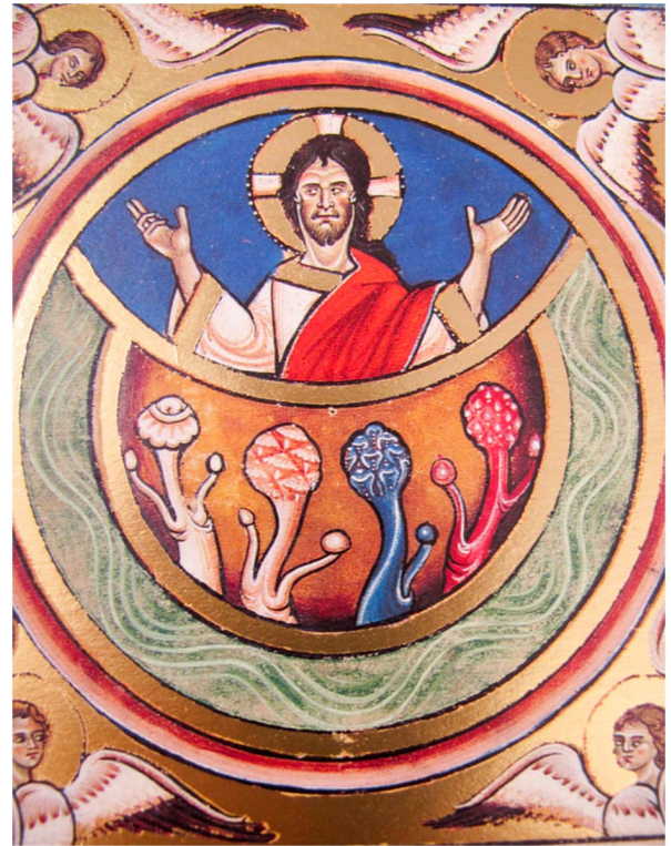
Figure 14. God Creates Plants. Great Canterbury Psalter Folio 1, England, ca. 1200

Numerous red, blue, orange, and tan stylized mushrooms are found in the first 100 pages, including this picture (Figure 14) showing God as the Creator of Plants, or more specifically as Creator of Sacred Plants. The red mushroom on the far right with white speckles is A. muscaria . The second one on the right is blue, manifesting the classic bluing reaction of psilocybin-containing mushrooms. While