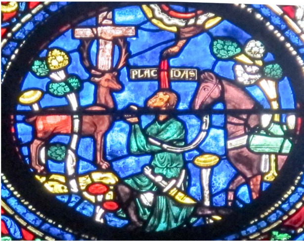
Figure 13. Conversion of Placidus, Saint Eustace Window. Chartres Cathedral, France, early 12th century

As in the fresco of the Purification of Isaiah's Lips at Saint Martin's (see Figure 9), entering this Saint Eustace scene from above are multicolored concentric rings – representing the separation between heaven and earth – from which an angelic hand emerges to anoint Saint Eustace's head with red rays of “uncircumscribable light.” This scene strongly suggests that entheogens played a seminal role in Saint Eustace's awakening, conversion, and entrance into Christ consciousness because of the fungiform representations surrounding the kneeling figure.