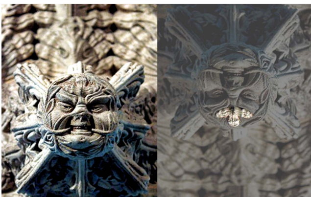
Figure 6. Green Man, Rosslyn Chapel, Scotland, 15th Century. Front view and inverted view with highlighted forehead