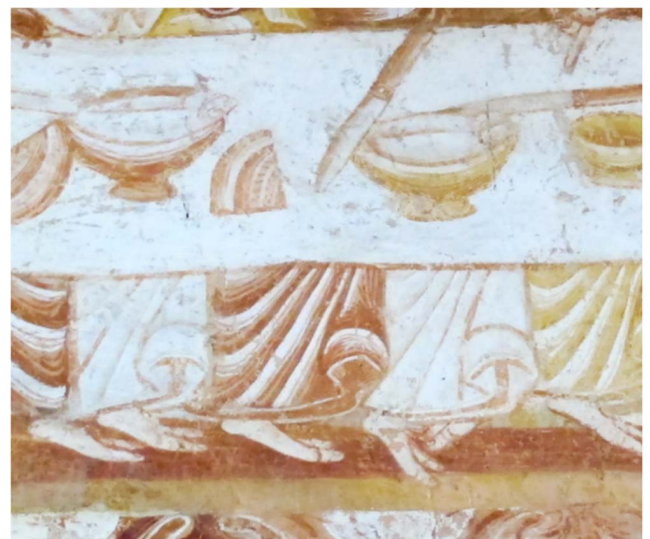
Figure 12. Detail of Last Supper , Saint Martin de Vicq. Showing Mushrooms in Hems of Disciples Robes. Early 12th century