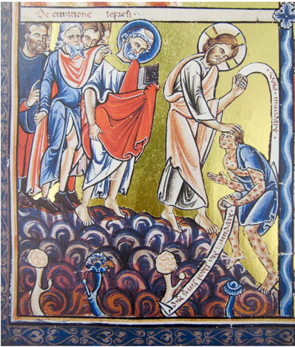
Figure 15. Jesus Heals the Leper. Great Canterbury Psalter, Folio 3, England, ca. 1200

over decades? The master artisans who designed, cut, and installed the stained glass windows? Or all of them collaborating together?