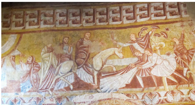
Figure 8. Purification of Isaiah's Lips and Christ's Entry into Jerusalem. Fresco on south choir wall, Church of Saint Martin de Vicq, France. Early 12th century