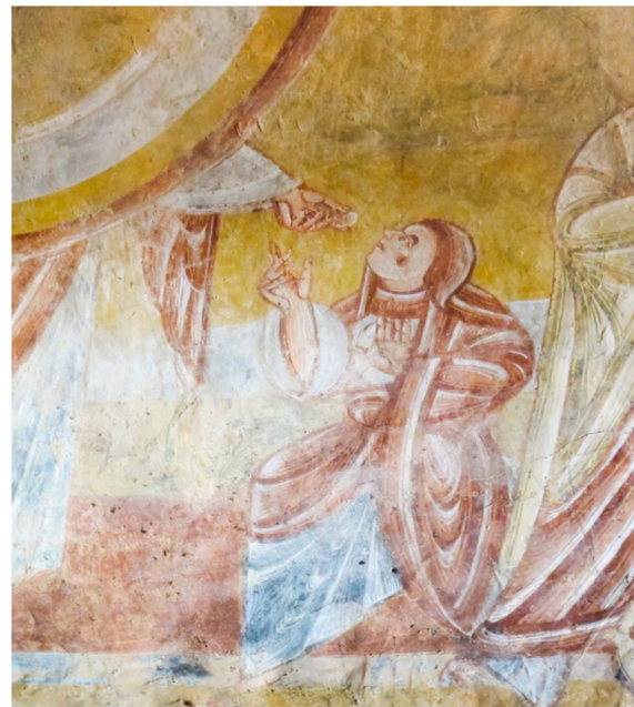
Figure 9. Detail of Purification of Isaiah's Lips. Fresco on south choir wall, Church of Saint Martin de Vicq, France. Early 12th century

In addition to this fresco, we found other entheogenic images at Saint Martin. Looking to the right in the direction in which Christ is proceeding, on the facing wall, is a painting of the Towers of Jerusalem . Standing on the roof of the tower