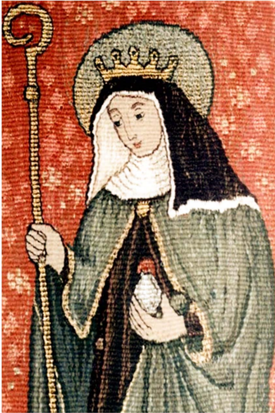
Figure 18. Tapestry of Saint Walburga. Woven by Sister Gretschmann, Abbey of Eichstätt, Germany

To cite another, the caption accompanying Rush's (2011) image of God creating Plants from the Great Canterbury Psalter reads "Notice that the deity has something in the palm of his right hand and at the tip of his left index finger" (DVD plate 1:9a). And in the text describing this image, Rush adds "God is likewise holding something that looks suspiciously like a mushroom, but it might be a symbol for alpha and omega" (p. 202). In reality, our image of God creating Plants, reproduced directly from the original Psalter housed in the Bibliothèque nationale de France, clearly indicates that God is not holding anything in either of his hands (Figure 14).