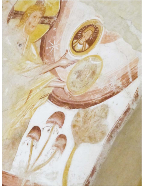
Figure 5. Genesis. The Creation of the Stars. Abbey of Saint-Savin-sur-Gartempe, 11th–12th century

In Scene 3, The Creation of the Stars, God wearing a cruciform halo places the sun and the moon into the sky. The moon and sun are each anthropomorphically represented by a head within a medallion and are placed in a heavenly realm separated from earth by a wide, multilayered barrier. Directly below the sun and the moon are two distinct types