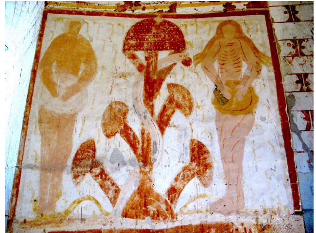
Figure 4. Temptation in the Garden of Eden. Chapel of Plaincourault, Indre District, Central France, ca. 1291