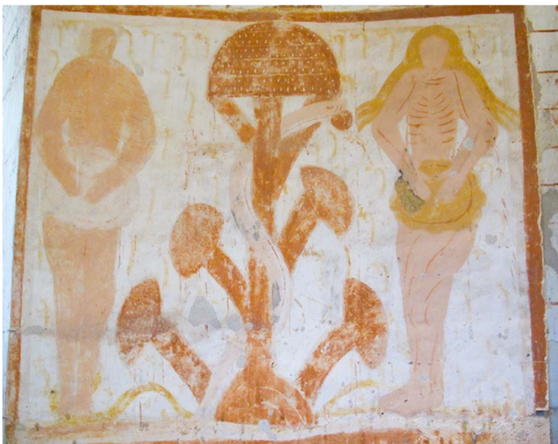
Figure 1. Temptation in the Garden of Eden, Chapel of Plaincourault, Indre, Central France, ca. 1291

To defend this conclusion, Wasson had to come to terms with “a fly-agaric in the ointment”: the controversial image of a large mushroom tree placed in the center of a medieval fresco depicting Adam and Eve in the Garden of Eden. Wasson first saw this late 13th century wall painting during his visit to the Chapel of Plaincourault on August 2, 1952. He later presented a drawing of this fresco as a color plate in Soma (Wasson, 1968, p. 180). Figure 1 is an unaltered