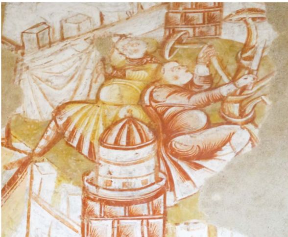
Figure 10. Detail from Towers of Jerusalem. Church of Saint Martin de Vicq, France. Early 12th century

The relevant Old Testament passage states, "Then flew one of the seraphims unto me, having a live coal in his hand, which he had taken with the tongs from off the altar: And he laid it upon my mouth, and said, Lo, this hath touched thy lips; and thine iniquity is taken away, and thy sin purged" (Isaiah, 6:6-7). However, in this medieval fresco of the Isaiah story, the object that the seraphim is holding out is