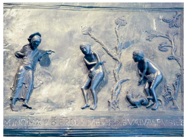
Figure 16. Panel 4, Adam and Eve, Bernward's Door of Salvation. St. Michael's Church, Hildesheim, Germany, 1015

Bernward's portrayal of the sacred entheogenic mushroom tree in the Transfiguration of Jesus is of particular significance for the psychedelic gospels theory, given that the Transfiguration is one of the main miracles attributed to Jesus in the Gospels. Unlike other miracles which were