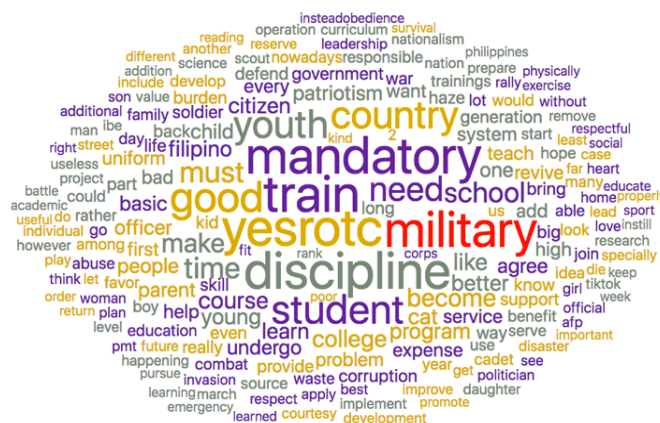
Figure 1. Word Cloud

Figure 1 presents the Word Cloud of the frequently used words found in parents' sentiments on the mandatory ROTC in senior high school. The visual representation highlights the most commonly used words through more extensive texts. As seen on the word cloud below, the most frequently used words are ROTC, train, discipline, yes, mandatory, military, good, student, youth, country, and need.