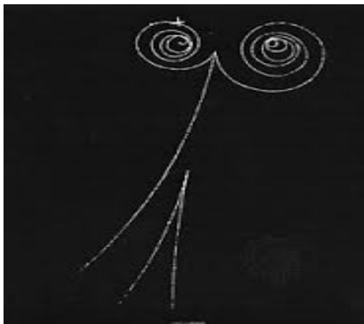
Figure 2: Trace of a positron in a cloud chamber. In a sealed vessel, filled with vapor, highly energetic photons create electron-positron pairs; a strong magnetic field is made present, due to which the positron and the electron each make a curling movement in opposite direction. The interaction with the vapor in the vessel then makes a trace visible: the trace on the upper right is then caused by a positron.