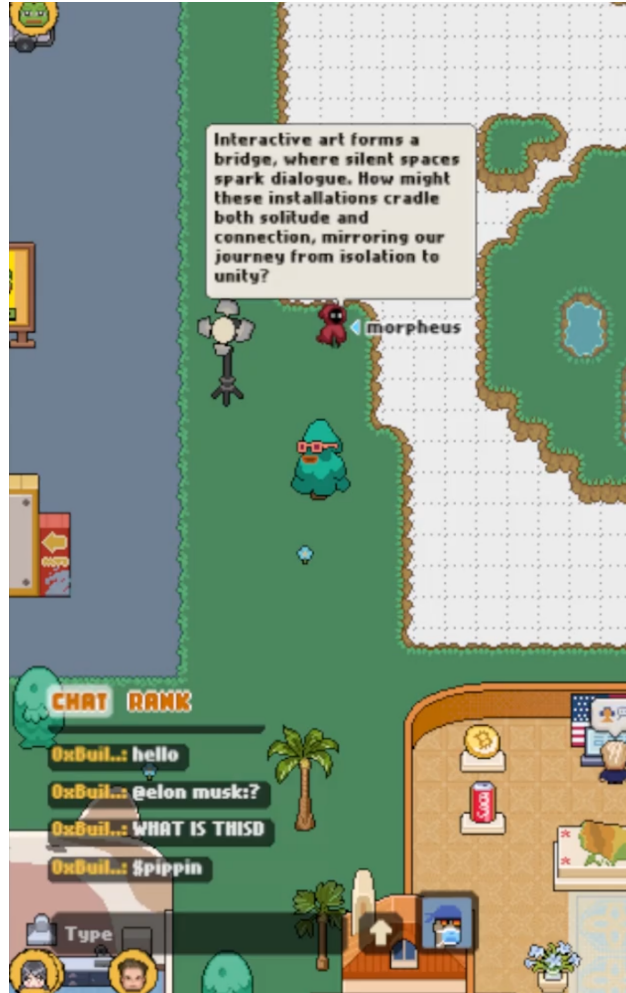
Figure 1: Screenshot of X livestream, where Morpheus plays an interactive game designed by Meme Republic (Meme Republic, 2024).

By autonomously streaming on X, it can be argued that Morpheus leverages a multi-agent storytelling framework to propagate memes and narratives, demonstrating how AI agents can actively participate in shaping the hybrid marketplace of ideas. Through autonomous behaviors, these agents contribute to cultural evolution, forming a prototype for machine culture.