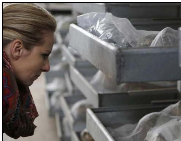
Woman looks at remains of her family members, found in Tomasica mass grave, in Sejkovaca identification center

Now let us turn to Malaysia Airlines Flight 370. MH370, a Boeing 777, vanished on March 8 with 239 people on board while it was en route from Kuala Lumpur to Beijing. For whatever reason, MH370 veered off-course and is said to have ended its journey in the Southern Indian Ocean west of Australia. Experts have contended that someone made the mid-course correction. So the question is, "Was the vanishing of MH370