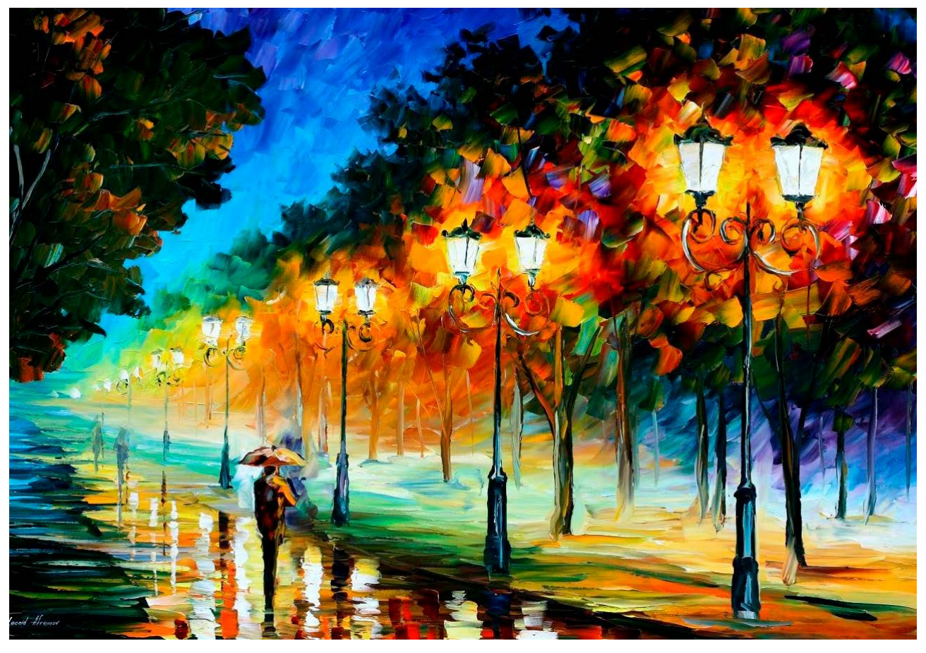
Perspective of the Night by Leonid Afremov (used with permission)

Below is a painting of an outdoor scene: