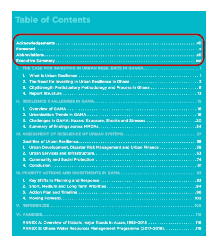
Figure 3. Page showing Table of Content of World Bank Report. The enclosed section shows subheadings dealing with exigence and aim, as well as selections showing values relevant to this analysis.

The "Foreword" to the report indicates an additional purpose beyond the response to the disaster: that Ghana's rapid urbanization demands the development of resilient cities capable of withstanding the challenges of rapidly developing cities. An important excerpt notes that in the wake the 2015 disaster,