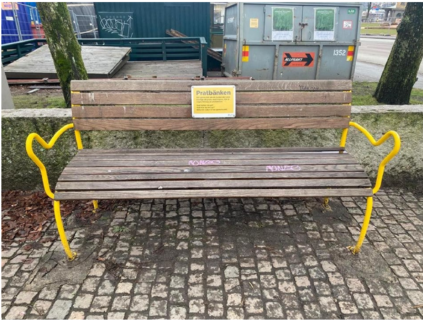
Picture 4 The “Talk Bench”. The sign indicates that sitting on this bench signals an openness to socializing. Location: Gothenburg, Sweden

barring people from sleeping or driving their cars in that space.