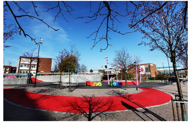
Picture 5 The carpet of the red rose, Rosengård, Malmö, Photographer Åsa Svensson

Now, the occurrence of seemingly contradictory evaluations arising from our definitions appears to me to be an