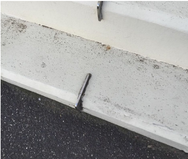
Picture 2 Skate stoppers installed to prevent skateboarders from grinding on the steps in Melbourne, Australia

we approach one another have significant moral importance in most ethical discourses and theories, as exemplified by the special laws addressing hate crimes in many countries today (Brax and Munthe 2015).