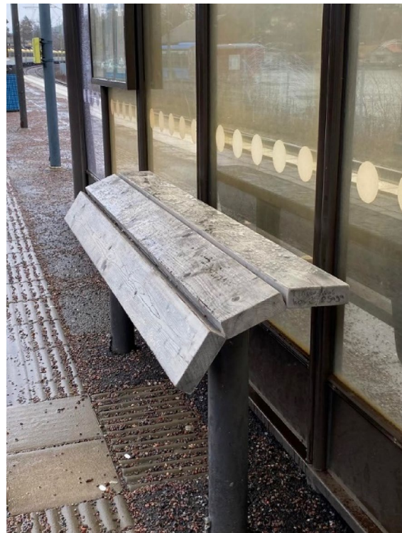
Picture 6 Stand-up bench, Norsesund, Sweden