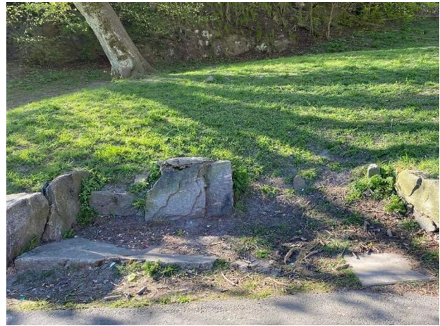
Picture 1 A former bench at a playground in Gothenburg, Sweden, where people used to sit, drink alcohol, and use drugs

There are few thoroughly developed definitions of “defensive design” in the debate. However, some definitions capture the phenomena to some extent, and these are of great use when developing a comprehensive account. One of the most cited definitions of hostile design is the following: