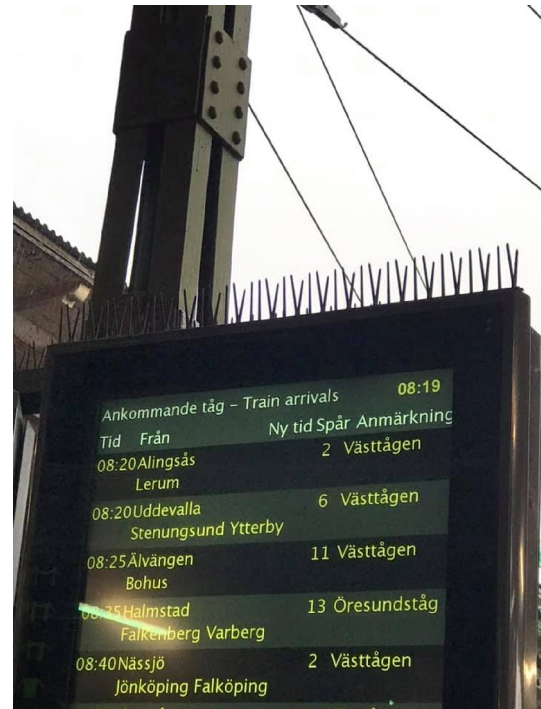
Picture 3 Anti-pigeon spikes in Gothenburg, Sweden

Third, from both literature and public discourse, it’s evident that we should consider skatestoppers—devices that deter or prevent skateboarding—as part of our discussions. (Refer to Picture 2.) Given this, it becomes somewhat implausible to include “vulnerable groups” within the definition of defensive design. While some skateboarders can be