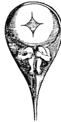
Fig. 1. Preformationism exemplified by Nicolaas Hartsoecker, 1695.

“Of the infinite combinations of possibilities and possible series, the one that exists is the one through which the most essence or possibility is brought into existence. [...] Given the temporal and spatial extent of the world—in short, its capacity or receptivity —fit into that as great a variety of kinds of thing as possible.