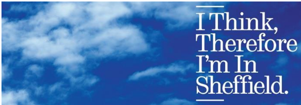
Figure 1: Recruitment material published by the University of Sheffield, based on PinC activities.

Philosophy, before it was ever written down, was spoken and lived. I think there is tremendous value in realising that wisdom can come from anywhere, that dialogue is something we can practise and perfect, and that we are all able to help one another make intellectual progress. That is why I still use many of the pedagogical methods that I learned from doing this kind of work, and it is also why I still do philosophy in the community when the opportunity presents itself.