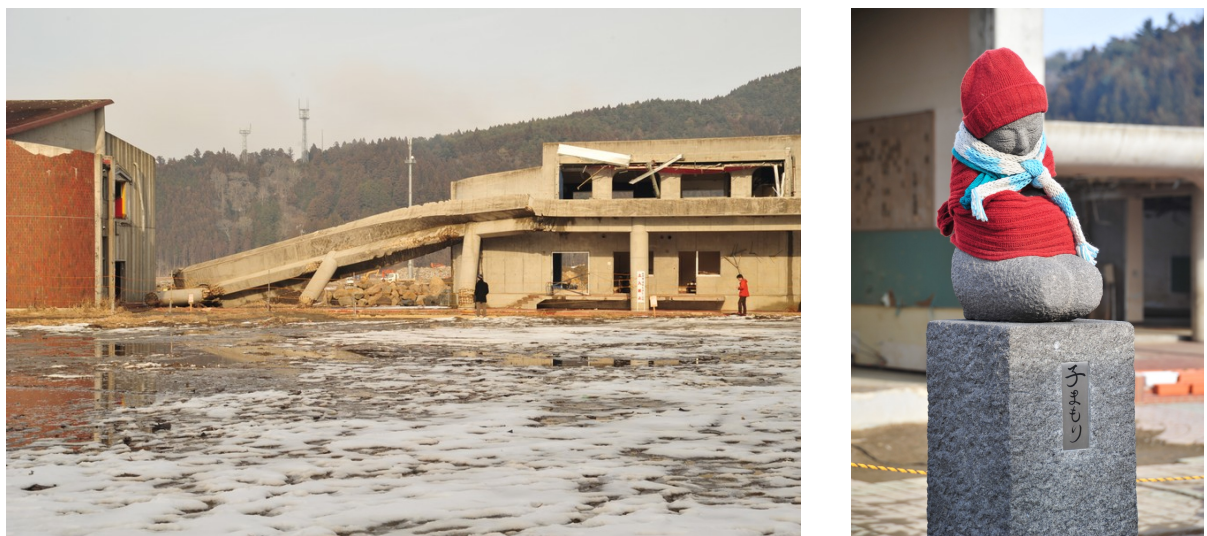
Figure 4. Remains of school facilities after the tsunami of 11 th March 2011 that stroke NE Japan. The evacuation plan failed resulting in the death of many small children. The statue was placed a reminder.