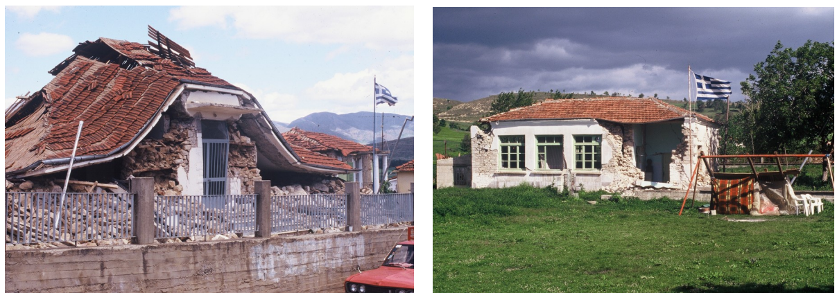
Figure 5. Remains of school buildings that collapsed after the earthquake of 12 th May 1995 in Grevena Province, Greece.