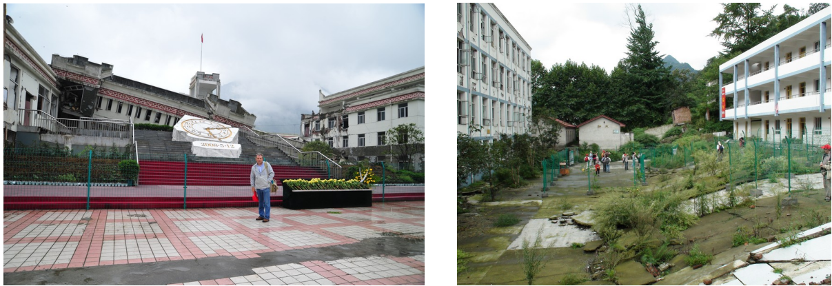
Figure 3. Remains of school facilities that collapse after the great earthquake of 12 th May 2008 in Sichuan Province, China. A monument was built as a reminder of the devastation.