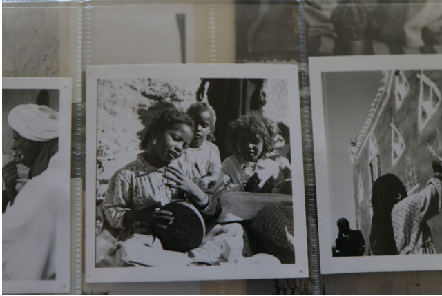
Photo from the Ethnographic Survey of Egyptian Nubia 1961-63 archive, Rare Books and Special Collections Library at the American University in Cairo

posts and WhatsApp digital chains from Alexandria, Egypt to Alexandria, Virginia. Both burden and gift, the past is entrusted to each new generation as a strategy of resilient resistance, of pain as possibility. 5