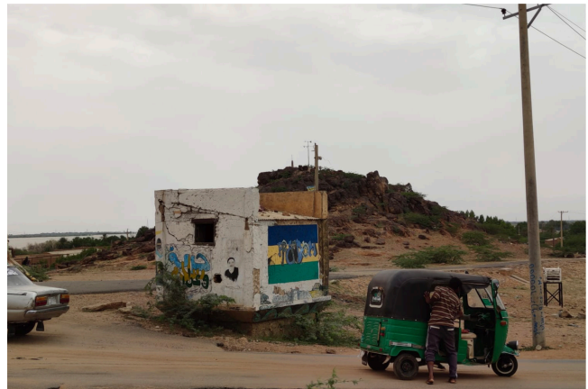
“Freedom” in both English and the Arabic language.

racializing work does waving this flag accomplish? If the act represents the desire for connection to an Africa that Sudan has either ostensibly lost or been unable to articulate more fully, do such invocations conjure demands for material assistance to Sudan’s own African, ever-marginalized and insufficiently Arabized peripheral communities? 13