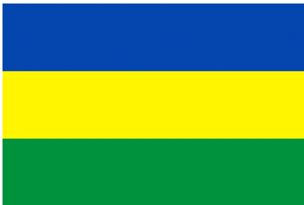
The flag of Sudan at independence.

After Gaafar Nimeiry came to power in a 1969 military coup, he replaced the independence flag in 1970 with the tri-color black, white, and red flag that invokes the aesthetic geopolitics of Arab nationalism linking Sudan to Egypt, Syria, Yemen, Iraq, etc. This choice arguably foreshadowed Nimeiry’s political transformation and the more substantive recasting of Sudan’s geopolitical place-in-the-world. The independence flag does not figure in the state’s contemporary representation of itself. The erasure of the independence flag calls into question the reconcilability of the very axis of racial differentiation, Arab/African, that has characterized so much of Sudan’s contemporary history. The former flag resembles the current flags of Rwanda, Tanzania and multiple other flags of an Africa articulated through racial-geographic vocabulary like south of the Sahara or sub-Saharan which conveniently conceal the ostensibly homogenous dark-complexioned map it interpolates in our collective imagination.