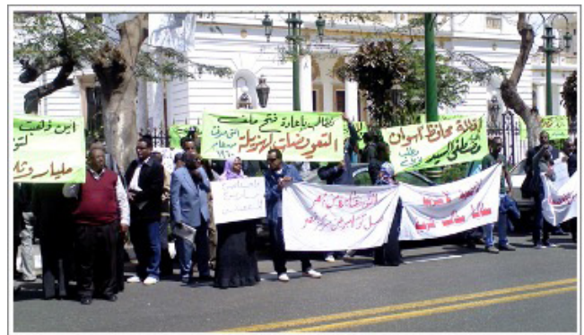
Protest by Nubian community activists outside People's Assembly, Cairo 2011

continue to this day. When police shot an unarmed Black teenager in Ferguson and got away with it, Nubians in Aswan posted on social media that #BlackLivesMatter. The US protests, in turn, galvanized local discussions about anti-black racism in the Arab world, further energizing Nubian activism. Nubians bestowed on Black protestors the honorific of kandaqa , denoting the powerful ancient Meroitic queens who were symbolically claimed by Sudanese of all ethno-linguistic backgrounds in their own uprising the year before. And later amidst America's 2020 uprising against racist state violence, a friend in Kom Ombo told me, after the police detained Nubian children in November 2020, "We can't breathe." 15