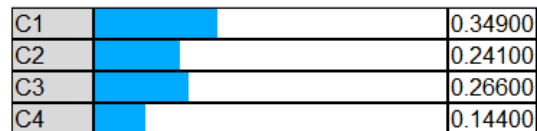
Figure 2. Graphic representation of the priority of the main research criteria

The inconsistency rate of the comparisons made was found to be 0.019, which is smaller than 0.1; therefore the comparisons made can be trusted.