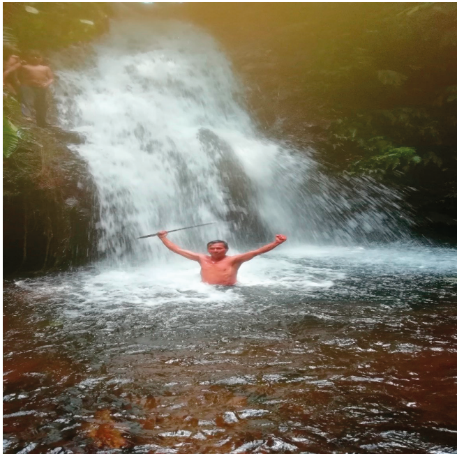
Fig. 3 Nawech during the ritual

“A joyful experience of nature is partially dependent upon a conscious or unconscious development of a sensitivity for qualities” (1989: 51). In fact, this society experiences its engagement with the waterfalls as manifold profound sentiments that go from feelings of suffering and pain during the chants to feelings of joy and strength when arutam’s power has been obtained.