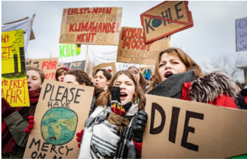
Figure 2 Friday for Future protest. Berlin, 2018.