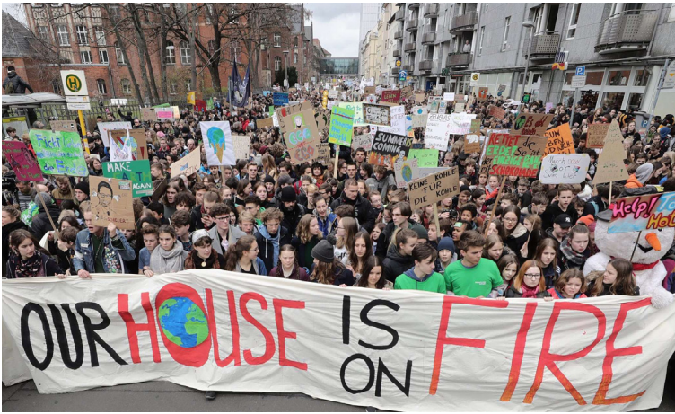
Figure 4 Friday for Future protest. Berlin, 2018.

courage against an injustice, or by providing a visual accompaniment to a verbal explanation of a certain topic; or they can serve to amplify a protest, for example by vast distribution via news outlets that gives the event more widespread attention and increases public awareness of the protest. As I am focusing on climate change protests, which are ongoing, I do not want to look at them solely as documentary images nor as illustrations. They are documentary images, but they are not just that. I am mainly interested in them when they are used as tools to reach the goals of voicing dissent, aiming for change in behavior and/or policy, and bringing awareness and new supporters to the cause. In these ways, protest images function as tools of the protest.