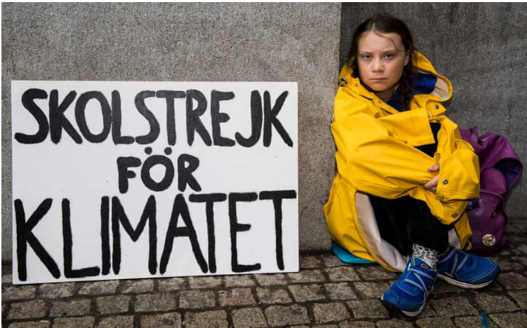
Figure 1 Stockholm, 2018.

Though my account may be applied to most kinds of protests, the specific elements differ with each cause. To this end, here I will focus on climate change protests. My reasoning for doing so is that such protests are frequent and not limited to a single country, making them especially suited to serve as a case study. Moreover, climate protests have achieved one key aspect of transformation: growing their support into a global movement. 3