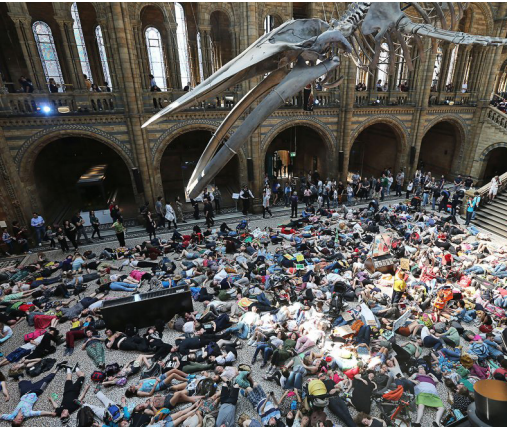
Figure 11 Extinction Rebellion protest in London, 2020.