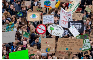
Figure 3 Friday for Future protest. Berlin, 2019.

havior. This brings the protest close to a form of resistance and civil disobedience.