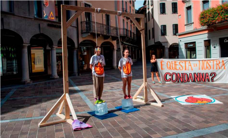
Figure 5 Climate protest in Lugano, 2020.

sical documentary sense, and not all these images have transformative power. Thus, more must be needed to make a narrative image transformative.