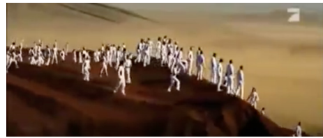
Figures 13-14 "Ende Gelände" protest against coal mining. Germany, 2019