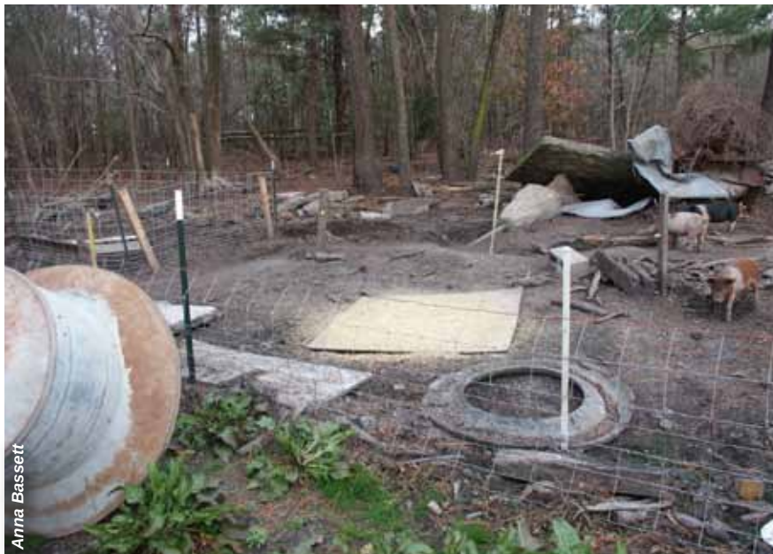
Farm debris can present a potential animal welfare hazard if it is left out in pasture or in areas where your animals will regularly have access.