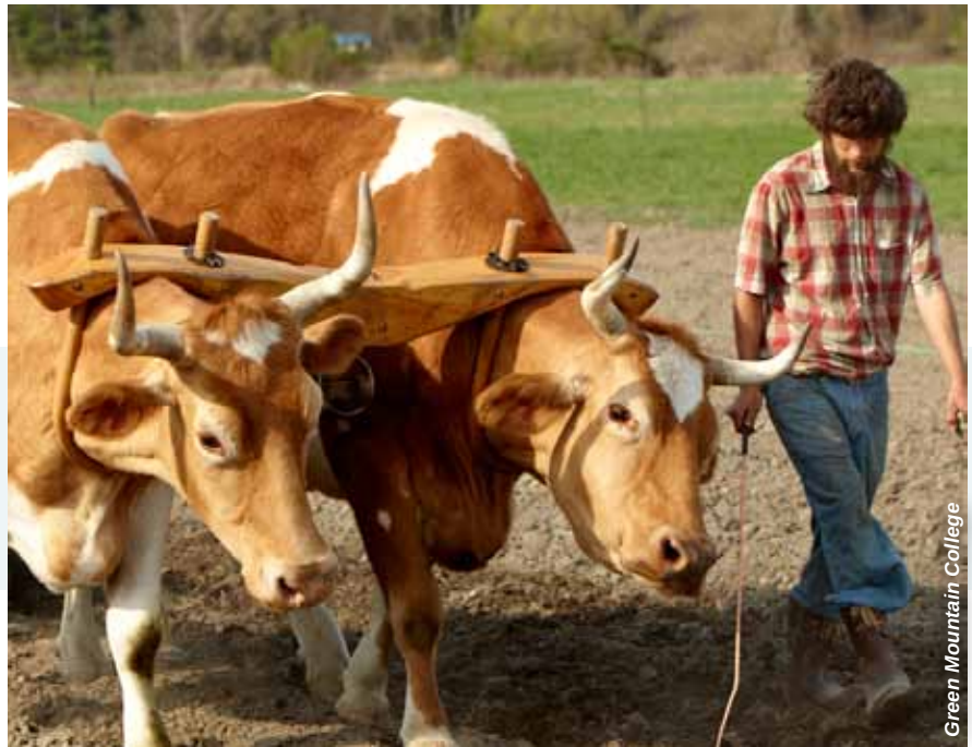
The Guernsey oxen team, Bill and Lou, have been central elements of the Green Mountain College farm since their arrival 10 years ago.

When the issue of the ox's injury arose, and under the consistent guidance of local veterinarians, I argued that a final decision should wait until fall so we could engage in campus-wide dialogue about the ethical issues involved. The decision was far from a no-brainer. In early October, I moderated a packed "open class" formal campus dialogue. A philosophy colleague laid out arguments against slaughter, including arguments focusing on the relationships formed with