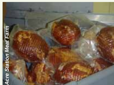
The new off-loading ramp was updated with the help of an AWA Good Husbandry Grant (left). Acre Station can also process meat to help farmers add further value.