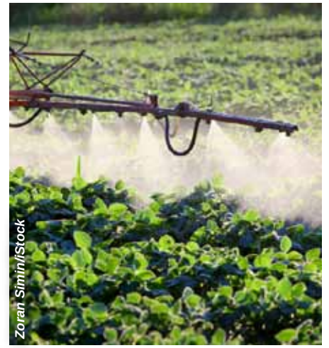
Spraying of soy field in early summer: GE crops have resulted in a dramatic increase in herbicide applications.