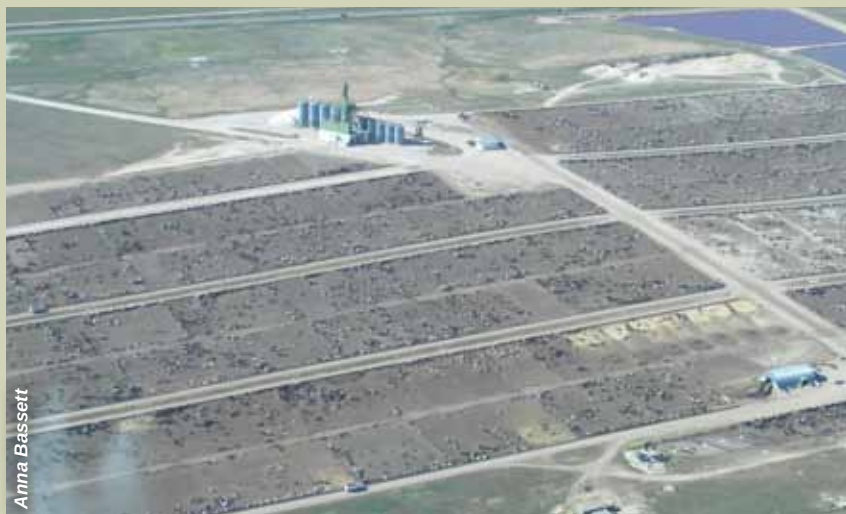
A Concentrated Animal Feeding Operation in Kansas. Note the lagoons in the background.