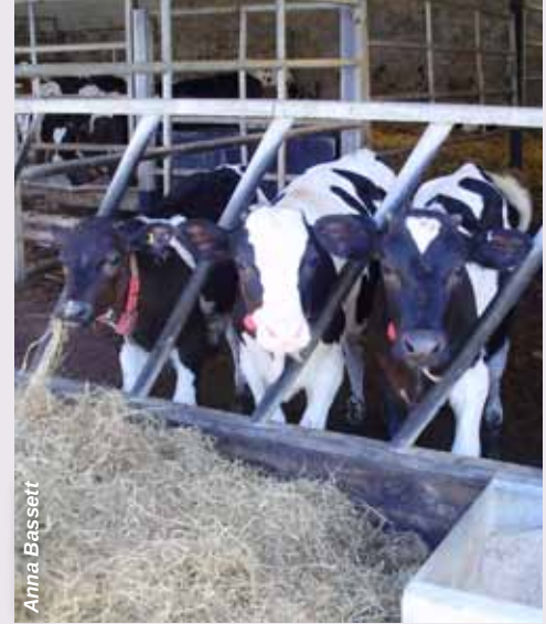
Coccidia is one of the most prevalent protozoal infections in North American livestock, including sheep, goats and cattle. Some coccidia may have little or no affect, while other types can cause severe infections, resulting in significant damage to the animal's gut—and sometimes rapid death.