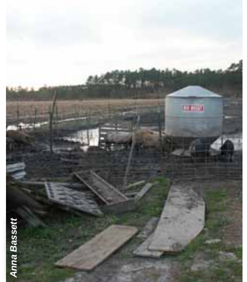
Participating farmers don't have to remove this type of material entirely from their farms—just from areas that animals will have access.

Another added benefit is that the farm will be more aesthetically pleasing to visitors. This is particularly important when you are trying to develop new markets: Consumers and other buyers may have never been to a working farm before, and will often base their opinions of a farm operation on first impressions. A clean, well-ordered farm leaves an impression of confidence in the farmer and their abilities. 🐄