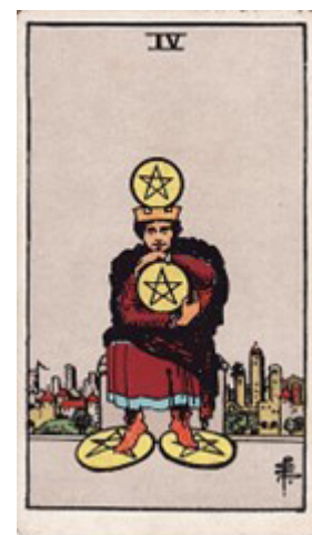
IV of Pentacles