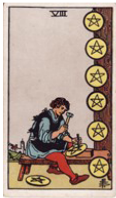
VIII of Pentacles

On a naturalistic interpretation, Tarot cards bear a resemblance to Rorschach tests. But tarot images offer layers of deliberate allusion; the activity fosters contemplation rather than ending at the initial perception, and tarot use aims to improve how one thinks, not merely test it. The cognitive, zetetic, and aesthetic values of tarot thus outdistance Rorschach tests.