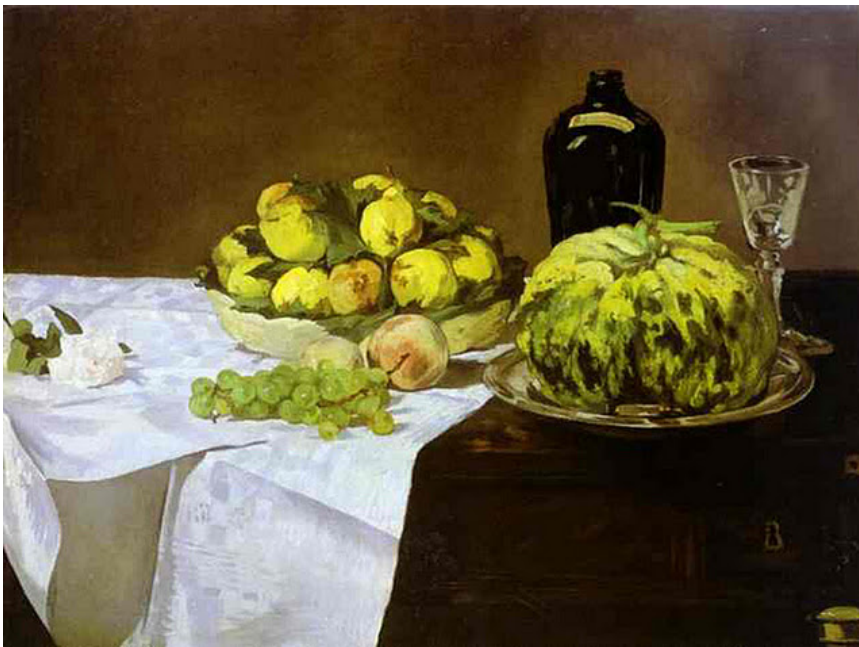
Edouard Manet, Still Life with Melon and Peaches. c. 1866

Assume I wish to convey to you why I am so unhappy, despite my smart job in a smart city, smart friends who adore me, and so on. I could simply list for you properties that I truly bear, for example, that I am forty-two, unfulfilled, alienated, and so on. But besides being tedious this is also a rather ineffective way of expressing what I wish to express, given the alternatives. So I opt for a bit of helpful figuration and instead offer a much more succinct kind of communication. Imagine that I say to you that ‘ this is what I have always wanted my life to be like,’ pointing to: