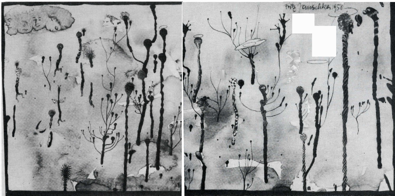
FRITZ JANSCHKA SAINTLINESS (1950)

was through with that he imitated what he had done in the collages in his paintings. He faked trompe l'oeil—actually newspaper, wood textures, everything else, because he got the inspiration from the actual collage. But then in his cubist period he used this to fake what he had done before with foreign materials. And just painted it that way, to look like that. Of course it took on a different shape that way too.”