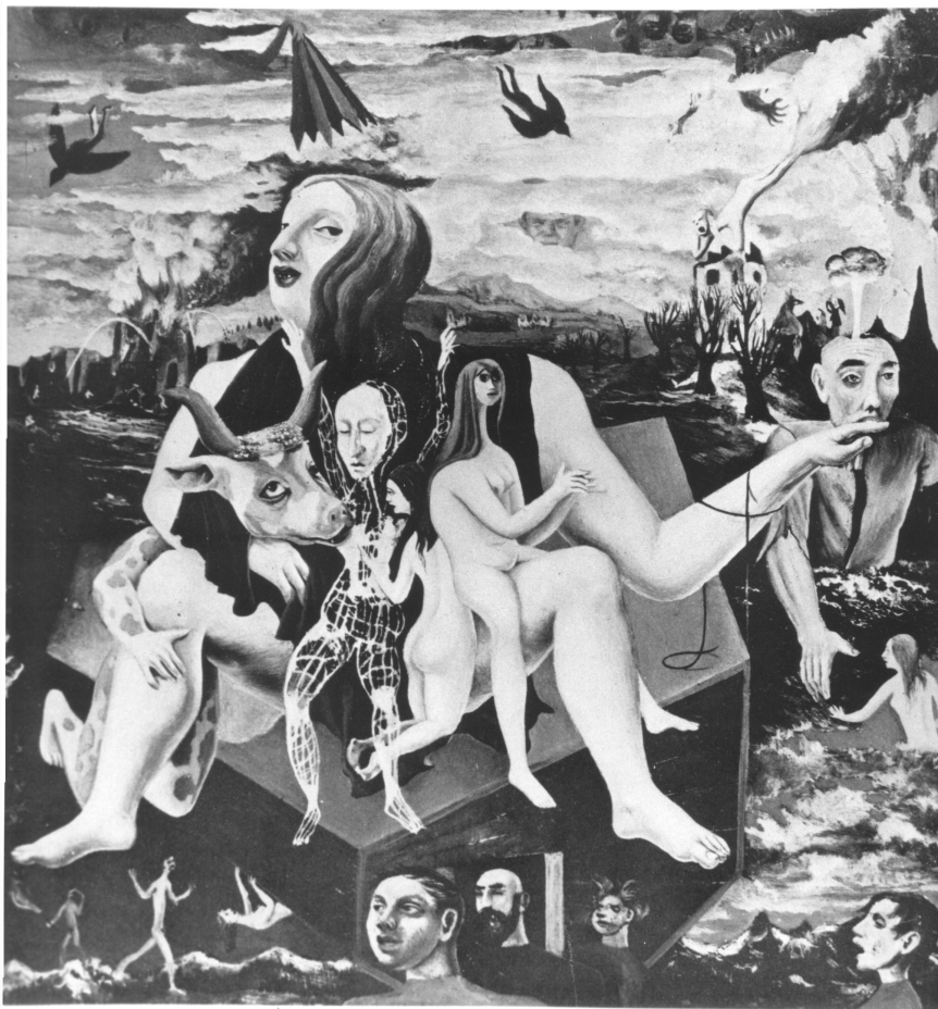
Das Floss der Medusa (1948-49)