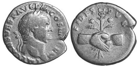
Fig. 1 Coin from Rome (73 CE).

On the obverse side (left), we find the image of Vespasian, the Roman emperor between 69 and 79 CE, while on the reverse side (right), the words FIDES PVBL appear. Clasped hands symbolize mutual faith and faithfulness, as in a handshake agreement; moreover, soldiers cannot easily shake hands unless they lay down their weapons and thereby rely on each other not to use them. The winged caduceus is a symbol of successful trade and commerce, and the poppy and corn were important commodities of the time. On our theory, it is not the least bit surprising that such imagery would accompany the pístis and fides lexica; moreover, it can explain its plausibility. For, if faith is resilient reliance and faithfulness is resilient reliability, it is plausible that it was by pístis and fides (faith) that the public relied on the emperor and his allies for the social goods depicted, and that it was by pístis and