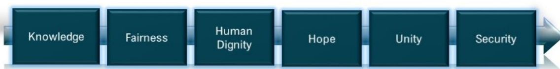
Figure 2. Social Change Process