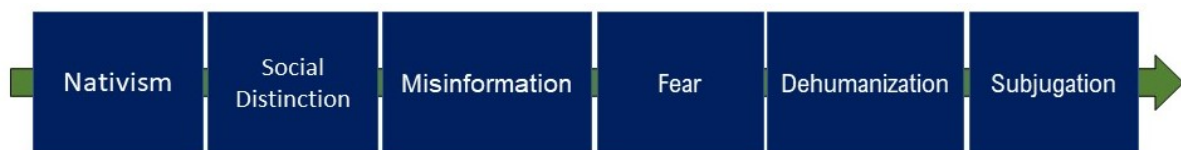
Figure 3. Demoralization Process

Demoralization is a “self-perceived incapacity to deal effectively with a specific stressful situation” and is “a combination of distress and subjective incompetence” (p. 308). 67 It is characterized by helplessness, hopelessness, resignation, 68 and loss of purpose and meaning in life. 69,70 Demoralization is linked to major depression, anxiety disorders, adjustment disorder, irritability, alexithymia (emotional numbness), type A behaviors, and grief. 68,69,71 Moreover, demoralized individuals are more likely to become confrontational and angry; 68,71 suffer from attachment disorders, have conduct problems, retreat from society, and commit suicide. 68,69,72 The demoralization process starts with nativism (see Figure 3). 17