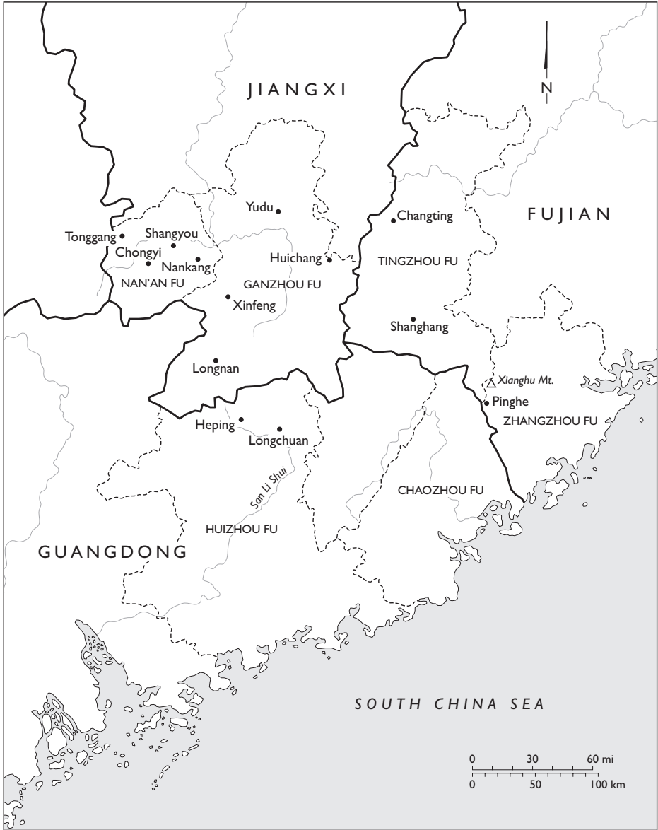
MAP 1 Principal locations for WangYangming's campaigns while he served as grand coordinator of Southern Gan, 1517–1518.