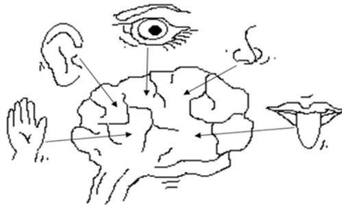
Fig. 1: Information Input

(a) Information Inputs: Individual receives information from the external world through their sensory pathways (Figure-02). These organs include eyes, nose, tongue, ear and skin which is also called as sensory organs. Different senses in the human body receive various information about the same objects or events in the external world. The information received through this process is analyzed for further actions [37]. Human brain is the mother board of the human body which controls and communicates to the rest of the human body organs. The brain stimulates the senses in order to send information received. So that brain controls the thoughts with the help of frontal lobe, parietal and temporal lobe. When the brain goes through irreparable damage it impacts on overall or partial functions of it [38 & 39].