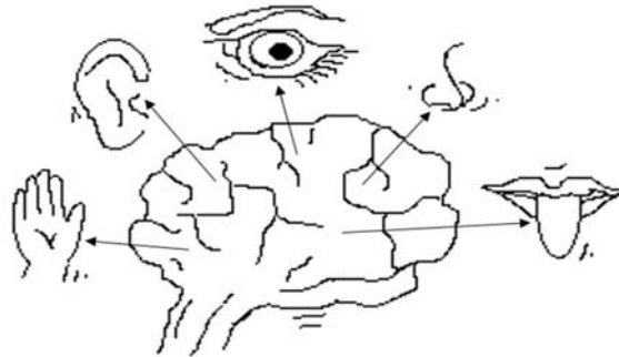
Fig. 3: Information Output

by deciding what to do and what not to do. The authors Shari et al., (2016) reported that, few students having high intelligence will do well both inside and outside the classroom by exhibiting good social skills and common sense [43]. The frontal lobe in the human brain mainly works on the implementation action-oriented representations [44]. Family and school were found to be more effective on student's decision making process and parents and teachers play an important role to influence the students for the adopting skills of problem solving [45].