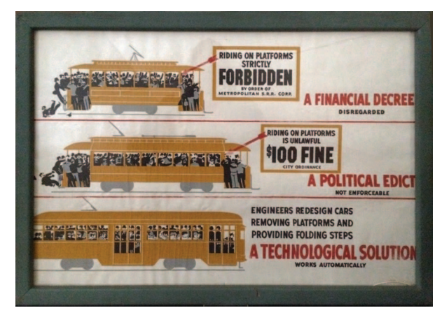
FIGURE 3. Graphic displayed at Technocracy Inc meeting halls and public exhibits from the 1930s.

science. Electric appliances, for example, extended productivity and leisure pursuits; radio entertained, educated, and united the nation; motor vehicles and aircraft provided a new mobility for at least a privileged few.