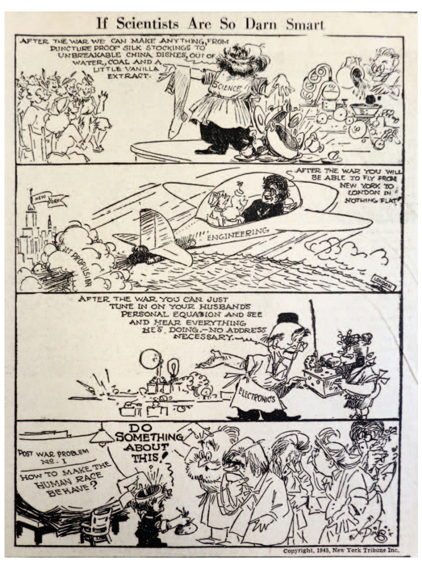
FIGURE 1. Engineers and scientists as social problem-solvers.

Digital Object Identifier 10.1109/MTS.2018.2795118 Date of publication: 2 March 2018