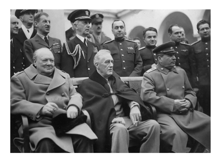
Fig. 2. Winston Churchill (overweight, smoking a cigar), Franklin D. Roosevelt (smoking a cigarette; paralysis of right arm) and Josef Stalin (from the left; Yalta conference, 1945).

Paul Deschanel began to show extravagant behavioral changes but retained enough insight to step down (frontotemporal dementia appears the most likely diagnosis) [17].