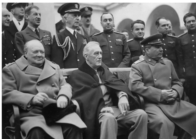
Fig. 2. Winston Churchill (overweight, smoking a cigar), Franklin D. Roosevelt (smoking a cigarette; paralysis of right arm) and Josef Stalin (from the left; Yalta conference, 1945).

Paul Deschanel began to show extravagant behavioral changes but retained enough insight to step down (frontotemporal dementia appears the most likely diagnosis) [17].