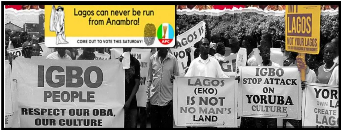
Photo of anti-Igbo protesters in Lagos. Date unknown.

In April 2015 nearing the 2015 gubernatorial election, the Oba of Lagos, Rilwan Akiolu, warned in a live audio that anyone (especially the Igbo) who failed to vote for the governorship candidate of the All Progressives Congress (APC), Mr. Akinwumi Ambode, would perish in the lagoon (Ameh. 2015).