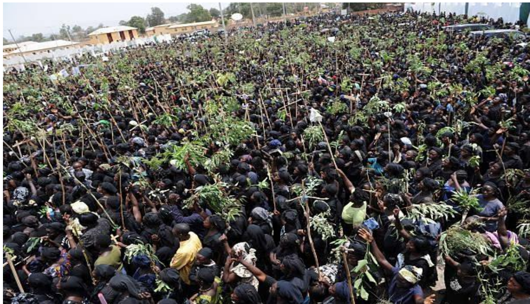
Plate 38: Women Protesting the Senseless and Systematic Acts of Ethnic Cleansing and Community Extinction in the Plateau State.

came together to protest. Women (both Christians and Muslims) in Plateau state all dressed in black clothes protested against the systematic agenda of ethnic cleansing and community extinction on the Plateau and other parts of the nation.