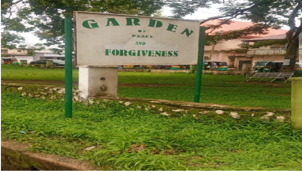
Plate 43: A Picture of the Garden of Peace and Forgiveness Created by the Plateau State Government to Encourage Peace and Forgiveness Among her People. Source: Researcher 16/08/2021