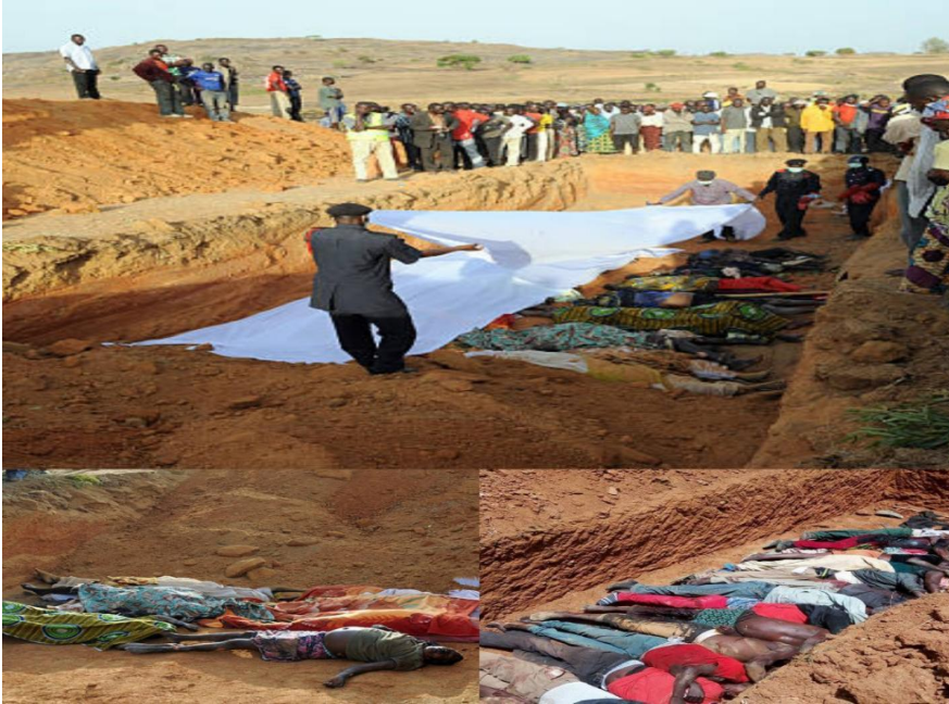
Plate 2a: Burying the dead bodies in a mass grave: These were the people that were killed during the attack of Dogo Nahawa.

The above picture shows a sad situation which is also evidence of this systematic and deliberate act of ethnic cleansing and community extinction in Dogo Nahawa. This has become so due to the fact that such gruesome killings and the vicious acts of perpetrators do go unabated. It was a gory scene as the victims of Sunday massacre in Dogo Nahawa were buried in a mass grave on Monday by indigenes of the state. Human bodies were dumped in tersely opened ground without coffins or obituary dressing associated with traditional burial in local communities. Bodies of the dead were moved in vans to locations of burial by relatives. The perpetrators had shown no mercy. They did not spare women and children or even a four-day-old baby from their machetes. In one area alone, five babies and 28 children aged five or less were killed. The violence in three mostly Christian villages appeared to be reprisal attacks following the January unrest in Jos -when most of the victims were Muslims (SaharaReporters 3). The then Acting President, Goodluck Jonathan, in a national broadcast said: