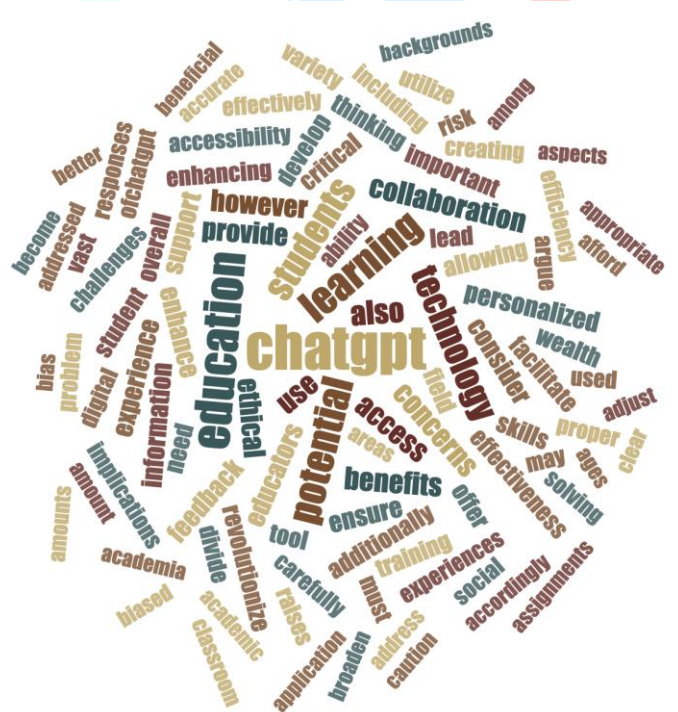
Figure 1. Word Cloud

The interpretation and analysis were based on NVivo. The following images depict the word frequency query – word cloud and text search – word tree.