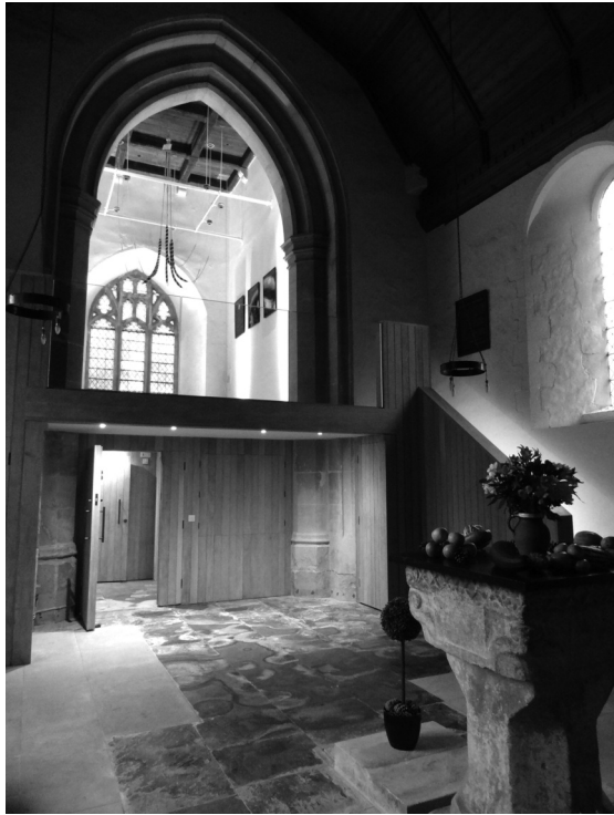
Figure 1: Church of St Nicholas, Great Wilbraham, England; west end.

a gathering space at the rear of the nave. Against the preference of some of the statutory consultees, the gallery projects forward of the base of the tower.