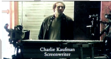
Adaptation , w. Charlie Kaufman, d. Spike Jonze, Sony Pictures, 2002

In addition, as Michaels brilliantly demonstrates, artworks can even draw on questions of intentionality, thematize them, be about them. 9 They can make process more or less visible; they can play with the complexities and raise difficult questions for us to answer. Winogrand’s photographs, Michaels shows, are about the difference between a mere document and a work of art—very similar to the difference between a mere piece of cardboard and a box. Charlie Kaufman’s Adaptation , to take a different example, features a character called Charlie Kaufman trying to make a movie about flowers but ending up making a movie about himself, Charlie Kaufman, trying to make a movie. How would a “death of the author” type even begin to understand this film?