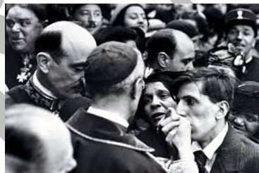
Henri Cartier-Bresson, "Cardinal Pacelli at Montmartre, Paris" (1938)

We now have a decent way, as I see it, to understand Cartier-Bresson's "Cardinal Pacelli" photograph (1938), in which, as Michaels brilliantly notices, there's a "kind of rhyme between [two] bald men looking down." 20 Cartier-Bresson didn't tell those two men to go bald, to attend the event, or to stand facing in the same direction. But that doesn't mean intention (in the everyday sense) isn't relevant. Cartier-Bresson didn't control the movement of heads, but he did control the release of the image. He could have chosen a different image on his contact sheet—or he could simply have chosen not to display a picture of the Pope at all. We don't ask, as we would with a painted canvas, "why are there two bald heads here?" 21 (Again, Michaels is excellent on the painting-photography distinction.) But we do ask "why did Cartier-Bresson choose the shot with the two bald heads?" There is still an intention working causally; it's just a postulated display-intention, not an empirical conception-intention.