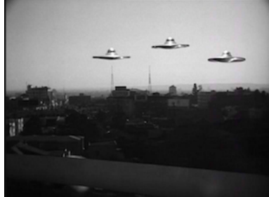
Plan 9 From Outer Space , w. & dir. Ed Wood, Valiant Pictures, 1959

Evil Dead , a brilliant joke? Those decisions, which we often make without realizing it, are decisions about intention. (Verbal irony always implies an author.) Or again: have you ever found yourself saying “oops” when you saw a boom microphone straying onto camera? “Oops” means that someone messed up, which means that they failed to do what they meant to, which means that, again, you’re assuming intentions whether you think you are or not. And did you feel “wow” when you looked at the Sistine Chapel ceiling? The experience of awe in response to virtuosity is another place where we’re thinking about artists, however much we take ourselves to agree with Roland Barthes. 8