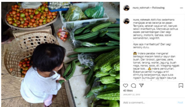
Figure 7. Doing Simple Activities to Children's Abilities Development

physical balance. I also share things that have already been experienced or done by themselves because there is more like that". Furthermore, Figure 7 shows the sharenting conducted by participants by carrying out daily activities in the form of buying goods in traditional markets. The sharenting activities shown in Figure 7 below have the aim to improve children's cognitive and psychomotor development, as well as increase social sensitivity in children.