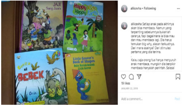
Figure 4. Sharenting by Creating Reading Interest in Children

social media account. In one of the posts on Instagram AF shared a photo of the book by providing information on educational writing to foster children's anger. Figure 4 shows the Sharenting conducted by the participants by invited children to go to the library and sharing photos about books that can be read with children.