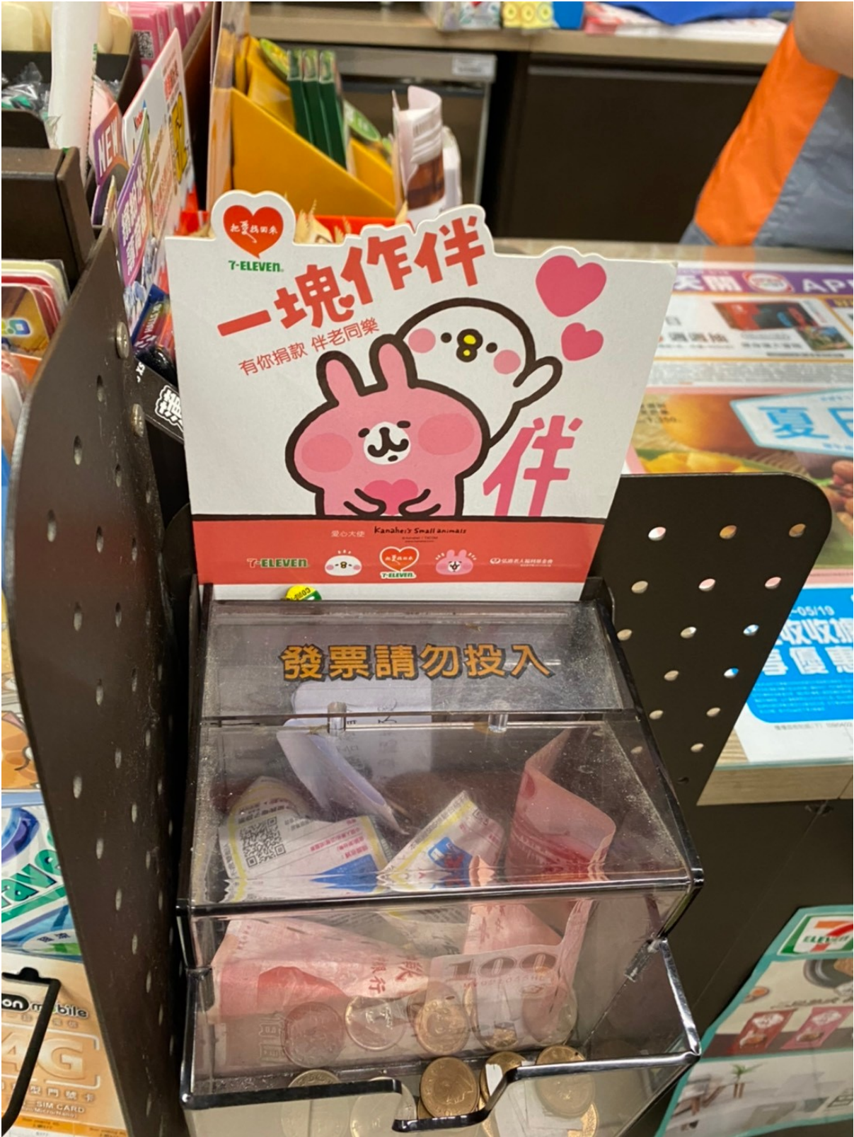
FIGURE 5. A donation box for cash at the counter of a convenience store noting “Not for GUIs”