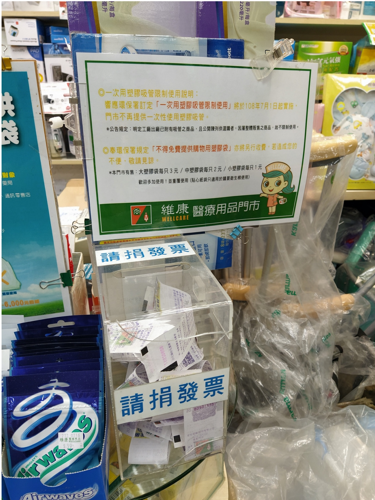
FIGURE 3. A donation box for GUIs at the counter of a pharmacy store