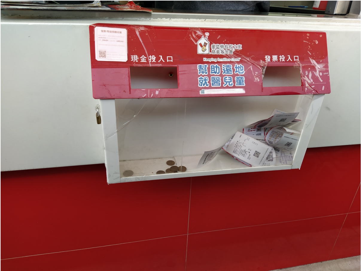
FIGURE 2. A donation box for cash and GUIs in front of a drive-through window