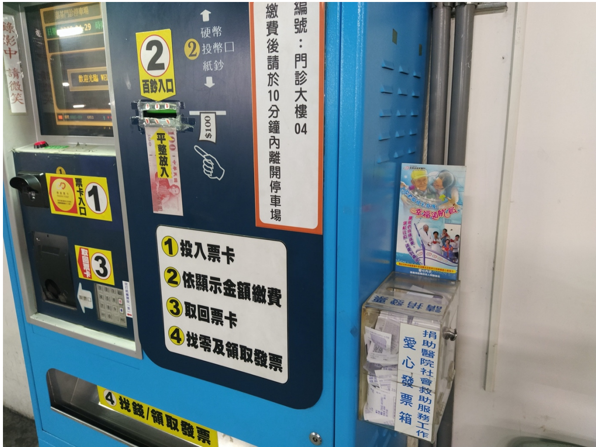
FIGURE 4. A donation box for GUIs attached to an automatic parking ticket machine