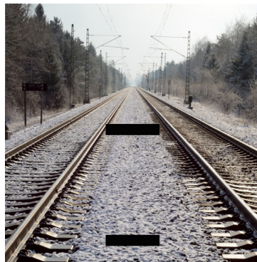
Figure 2: Ponzo Illusion

stimulus. The UIT strategy is to explain how the perceptual system achieves constant representation of the relevant property by giving it knowledge of the function and knowledge of the appropriate arguments. For example, Emmert's Law states that the perceived linear size of an object is proportional to the product of its perceived distance and the angle subtended on the retina. There are analogues for constancy of represented shape through rotation relative to the observer, constancy of lightness and color through variations in illumination conditions, constancy of position relative to movement of the perceiver, and so on. The perceptual system gets information about, e.g., perceived distance (inferred from more basic cues) and the angle subtended by an object in the visual field and then infers using Emmert's Law a size which is to be represented in perceptual experience. Inferential mechanisms are also used to explain illusions. For example, in the Ponzo illusion illustrated in Figure 2, the black bars are the same length but the depth cues provided by the receding track generate a visual representation of the upper bar as longer than the lower.