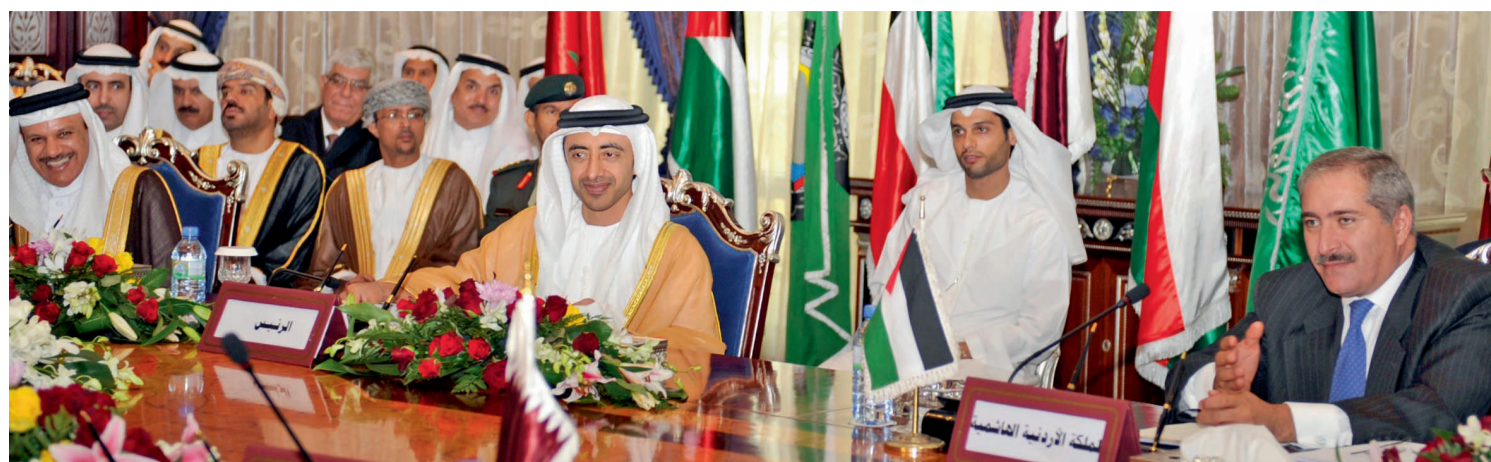
UAE Foreign Minister Shaikh Abdullah bin Zayed Al Nahyan, Jordann Foreign Minister Nasser Judeh and other officials during a ministerial meeting of Gulf Cooperation Council member states in Jeddah.

Admitting new members into the GCC bloc raise specific concerns. Extending the integration process before a template "integration model" has been developed and proven successful to a number of other countries could be tricky. Furthermore, engaging in a process of economic integration with Jordan and Morocco with different levels of economic development can be challenging. GCC countries have larger and more prosperous markets than other countries. In addition, the average worker in the GCC is more likely to earn more and pay fewer taxes than the average worker in other countries. To counter such a problem, the GCC