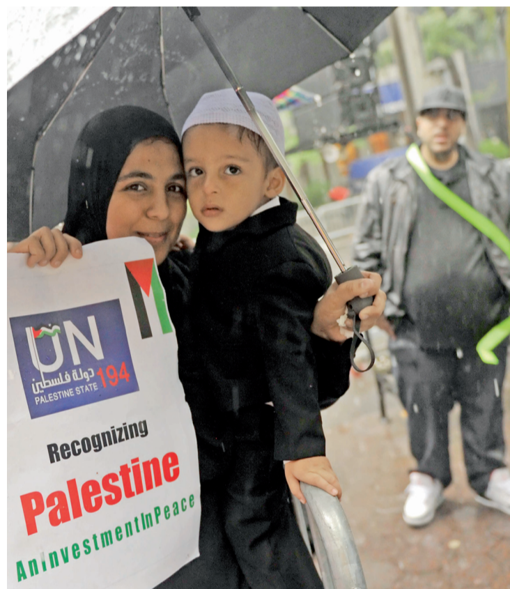
Palestinian statehood supporters gather near the United Nations in New York.