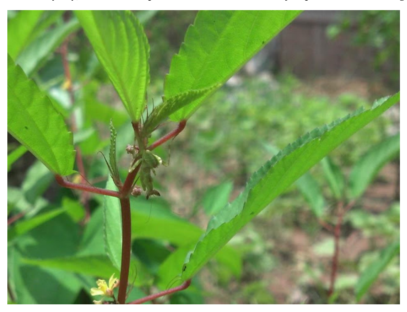
Photo: Me, Young Mantis.

I was born in a village, called the Jute Plant Village, near the Bird Village. The photo of mine was taken by Kingfisher the Wise of the Bird Village, showing me while just 3 days old. That's why I looked very tiny, even when compared to a newborn leave of the jute plant where I was clinging.