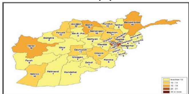
Adult Female Literacy by Province 2012