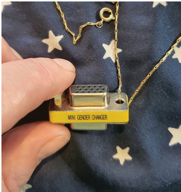
Figure 3. Here we see a female gender changer (two sides with pin holes – female) talisman gifted to the graduate of the GCA. This socket typically connects to a male gender changer (two sides with pins – male).

Hardware is a mystery, a barrier . . . playing is a way to get to know how stuff works . . . being able to interact with it gives one a sense of control and independence. Secretaries of today should have a toolkit to be able to Do It Themselves, a millennium witch bag. (GCA 2003, 4)