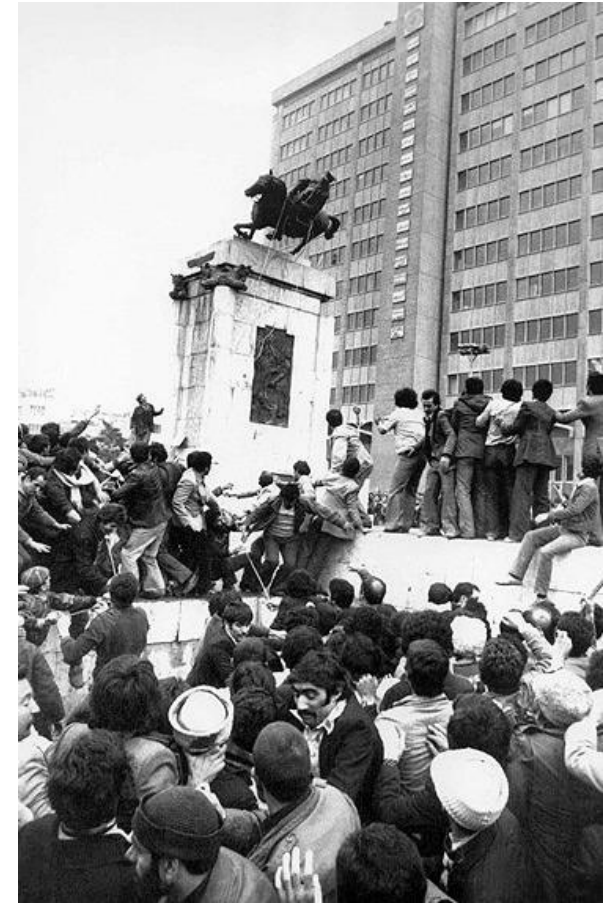
Figure 7: Iranian pulls down statue of Reza Shah Pahlavi in Toopkhaneh Square after his son, Mohammad Reza Shah Pahlavi, leaves the country, 1979. Source: https://commons.wikimedia.org/wiki/File%3AReza_Shah_Statue_1979_Revolution.jpg 2016

(Figure 7). This symbolic fall of the statue as well as the change in the square's name (from Sepah to Imam Khomeini Square) brought a new chapter in political life of the square.