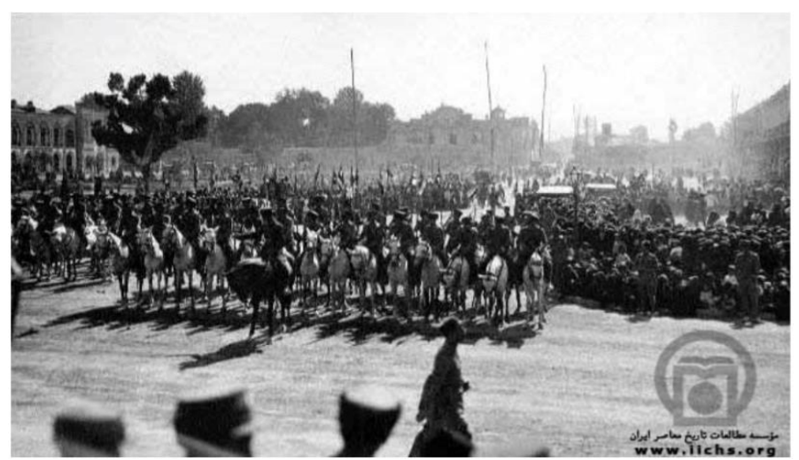
Figure 1: Toopkhaneh Square, Tehran, early 1900s. The image shows this historically important square of Tehran in the beginning of twentieth century, hosting a parade of armed forces on their horses.

the power structure on the urban form of Tehran (Madanipour 1998). Discussions of power relations are deeply linked with the way one authority legitimizes it and gains power over the others. A basic framework to settle this discussion can be based on Weber's typology of three types of legitimate domination, which is to cover all historically possible forms of legitimate government. Those three types can be briefly named as "legal rule," "traditional rule," and "charismatic rule" (Mommsen 1989). Charismatic rule is the authority that is gained by familial or religious status, while traditional rule is based on social class and money, and legal rule is what occurs under political parties. Soltani (2011) applied this framework to Iranian Naqhsh-e Jahan Square, a square that can be considered as a geometrical position for power; the manifestations of these three pillars of power can be categorized by simplifying the mosque as the representative of charismatic domination, the bazaar as the representative of traditional domination, and the palace as the representative of legal domination. Focusing on Toopkhaneh Square in Tehran, the next section will study the spatial transformation of square from its formation until the Islamic Revolution of 1978.