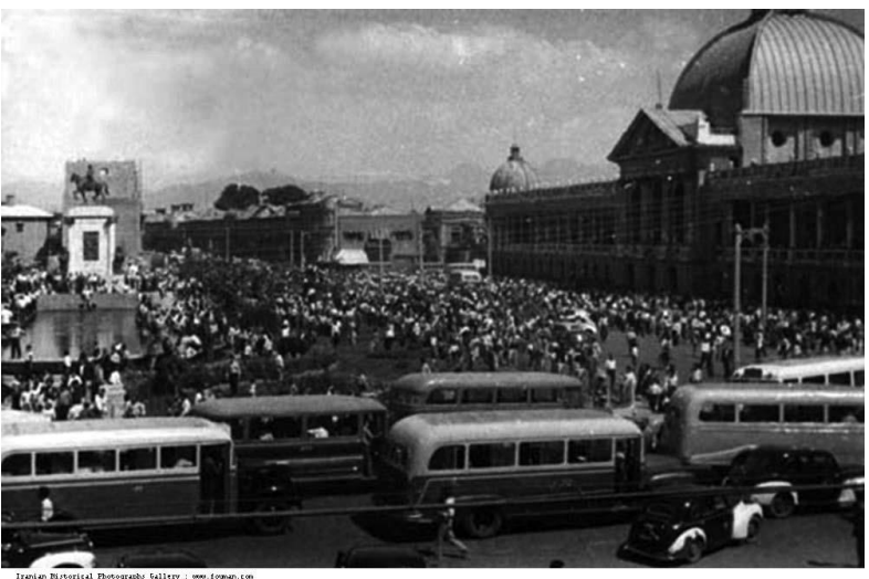
Figure 6: Tudeh Party demonstrations destabilized the political power of the democratic government of Dr. Mohammad Mosaddegh leading to the coup that brought back the Pahlavi Monarchy (statue seen on the horse), 1953, Toopkhaneh Square, Tehran.

During the days leading to the 1953 Iranian coup d'état, Toopkhaneh Square became the focal point for Anti-Shah political parties' meetings, revolutionaries' gatherings, and demonstrations like the Tudeh Party demonstrations (see Figure 6).