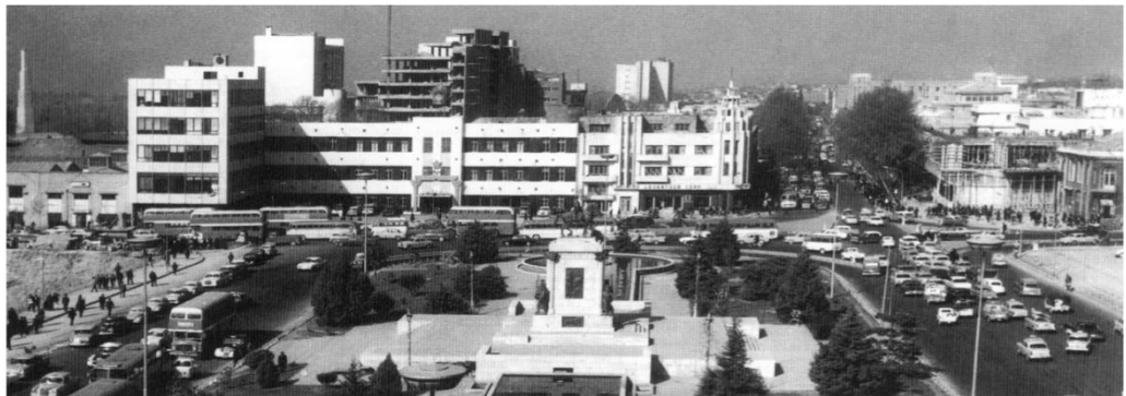
Figure 4: The western view of Toopkhaneh Square, Tehran, 1960–1980 (Mohammad Reza Shah Pahlavi period). The whole body of the urban environment as well as urban life has changed. Pedestrian movement is less visible and the buildings around the square are mostly demolished.

From 1949 on, sentiment for nationalization of Iran's oil industry grew and Toopkhaneh Square became as one of the most important gathering points for mass rallies and social demonstrations in supporting Iranian Oil Nationalization Movement (see Figure 5).