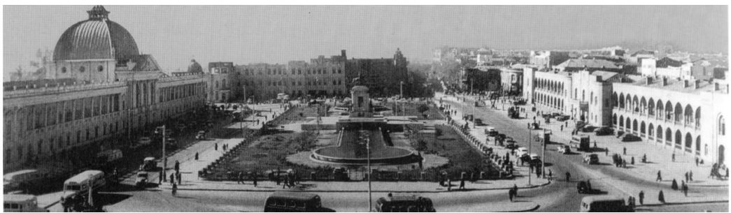
Figure 3: The western view of Toopkhaneh Square, Tehran, 1920–1960 (Reza Shah Pahlavi period), Reza Shah's period of reign lasted until 1941, but the main changes in the square until 1960 were parts of his modernization program. The landscaping has changed, and grass has replaced the tress. A statue of Reza Shah was erected in the center of the Square.