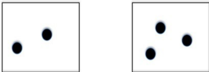
Figure 1: Subitizing or counting?

This is not yet counting; counting is exact enumeration. Subitizing is the ability to immediately recognise the size, or number, of a small set—usually <4 . Most animals subitize, rather than count. Infant humans also appear to be able to subitize (Rouselle & Noël 2008). This ancient or approximate number system (ANS) is a non-linguistic continuous representation 27 of quantities above 4; Dehaene calls it the number sense (1997). Take the following example. Whilst it is easy enough to determine which of the following two boxes contains the larger number of dots without having to count them: