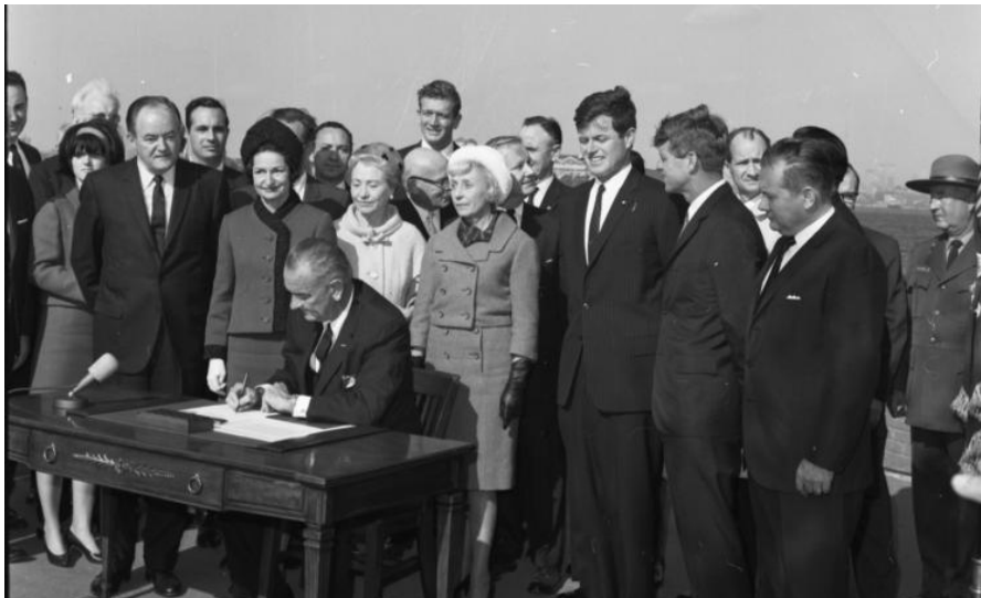
The saddest day in US history. President Johnson, with 2 Kennedy’s and ex-President Hoover, gives America to Mexico— Oct 3 rd 1965. Wolves in sheep’s clothing, like most Democrats from that day onward.

“At what point is the approach of danger to be expected? I answer, if it ever reach us it must spring up amongst us; it cannot come from abroad. If destruction be our lot, we must ourselves be its author and finisher. As a nation of freemen we must live through all time or die by suicide.” Abraham Lincoln (1838)