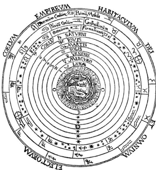
(Picture of geocentric Ptolemaic universe, not actually