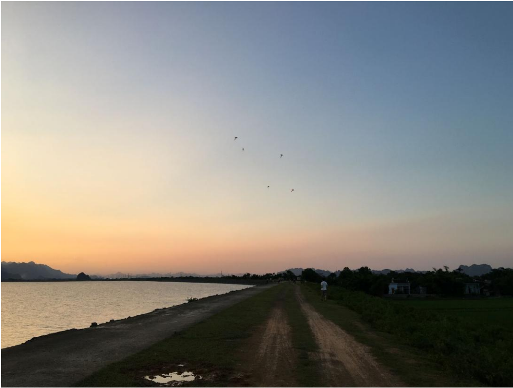
Evening at the riverbank, Cuc Phuong, Ninh Binh