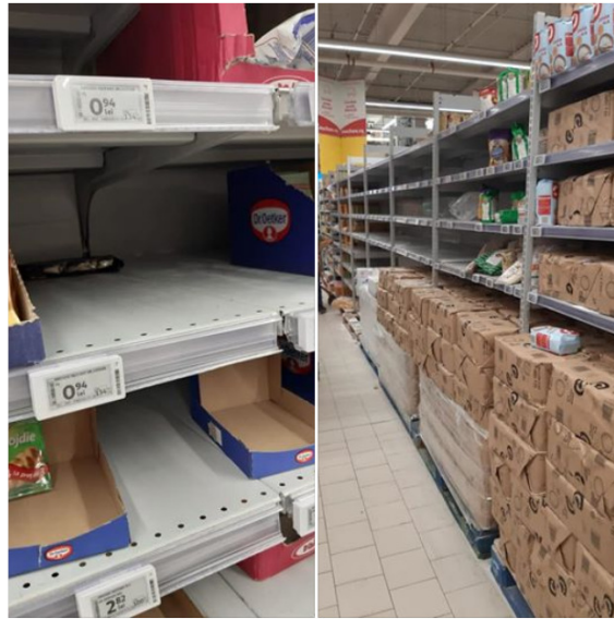
Figure 1: Photography of a supermarket from Romania

Romania, people have started to buy as much food as flour, pasta, water, oil, gourd and canned food to prepare with supplies. Thus, a chaos has already been created that does nothing more than amplify the panic even more.